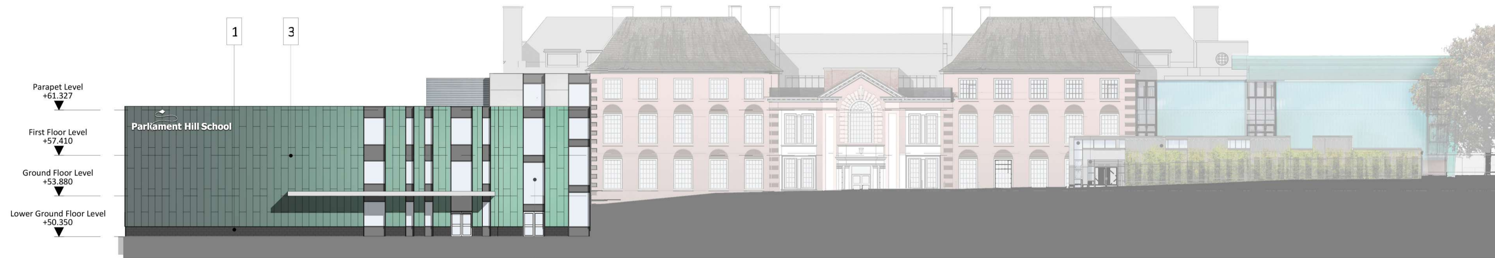
1. East - Highgate Road Elevation SCALE - 1 : 200@A1

B 21/05/18 RCG BFLA New external door added to South East elevation. Window size above amended