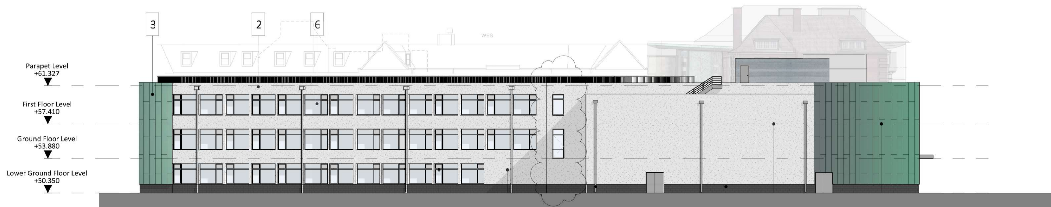
2. South East - Lissenden Gardens Elevation SCALE - 1 : 200@A1

Gloucester: 01452 525 019, Harrogate: 01423 815 121, Milton Keynes: 01908 255 620, Newcastle: 01913 898 917