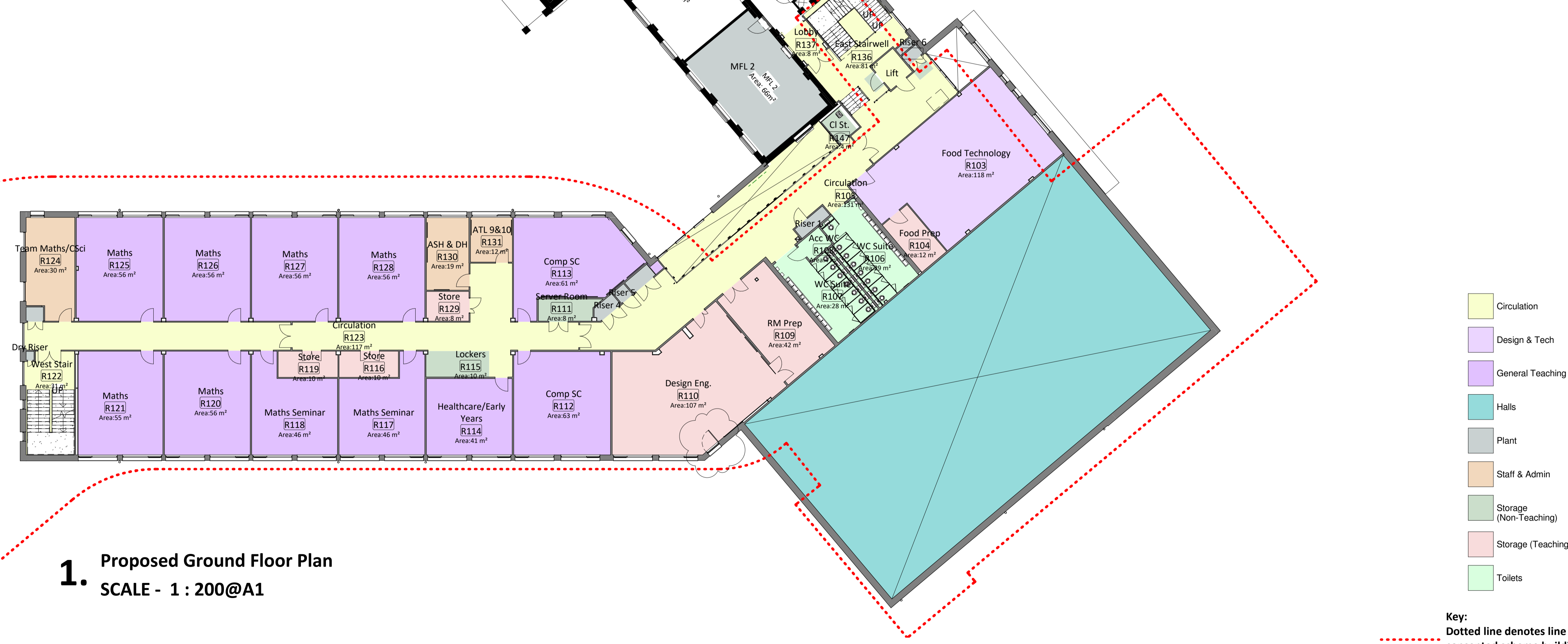
1. Proposed Ground Floor Plan SCALE - 1 : 200@A1