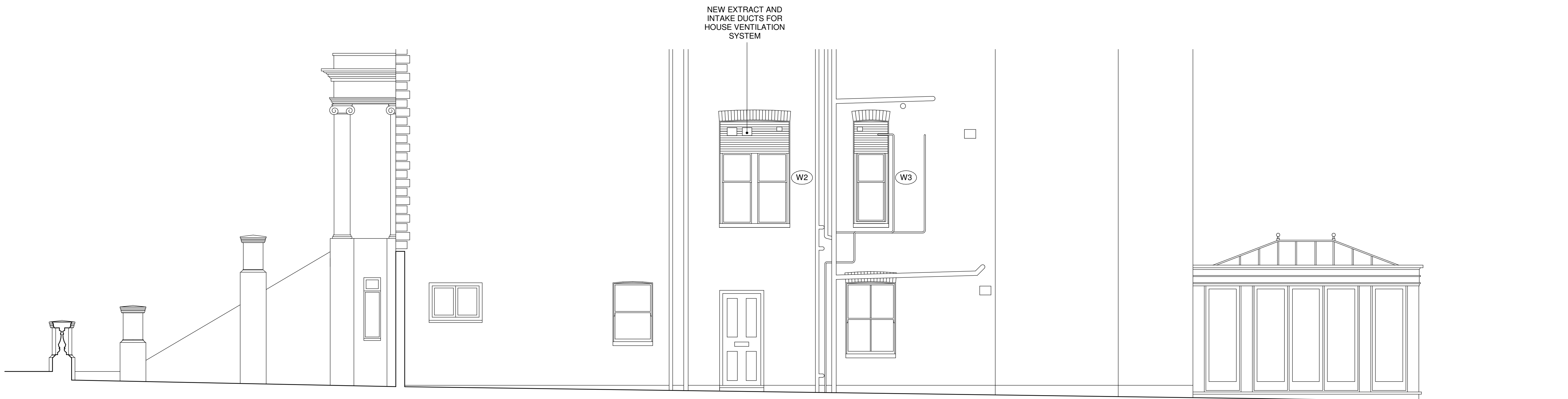
3 Proposed Side Elevation 1 : 50