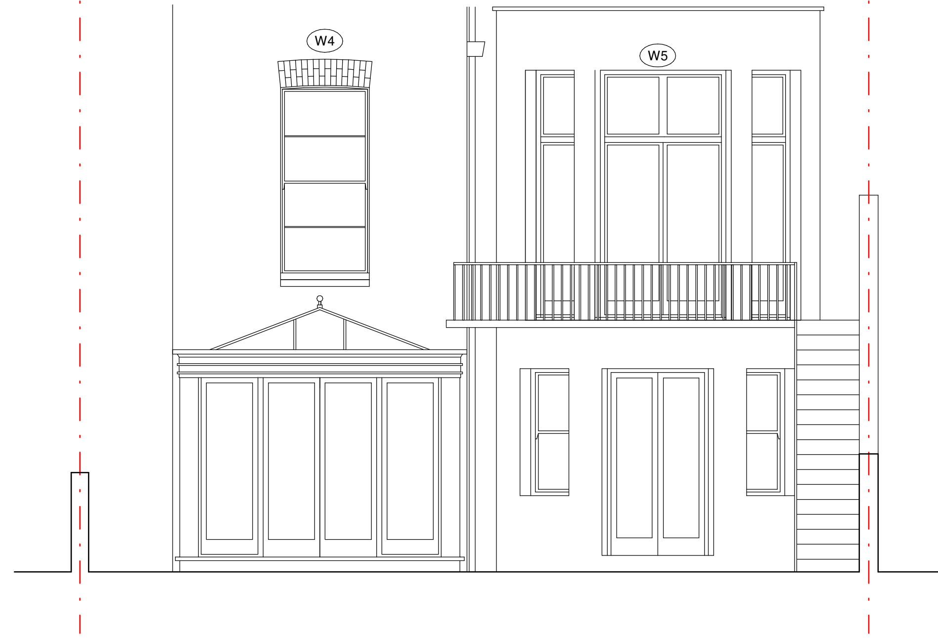
2 Proposed Back Elevation 1 : 50