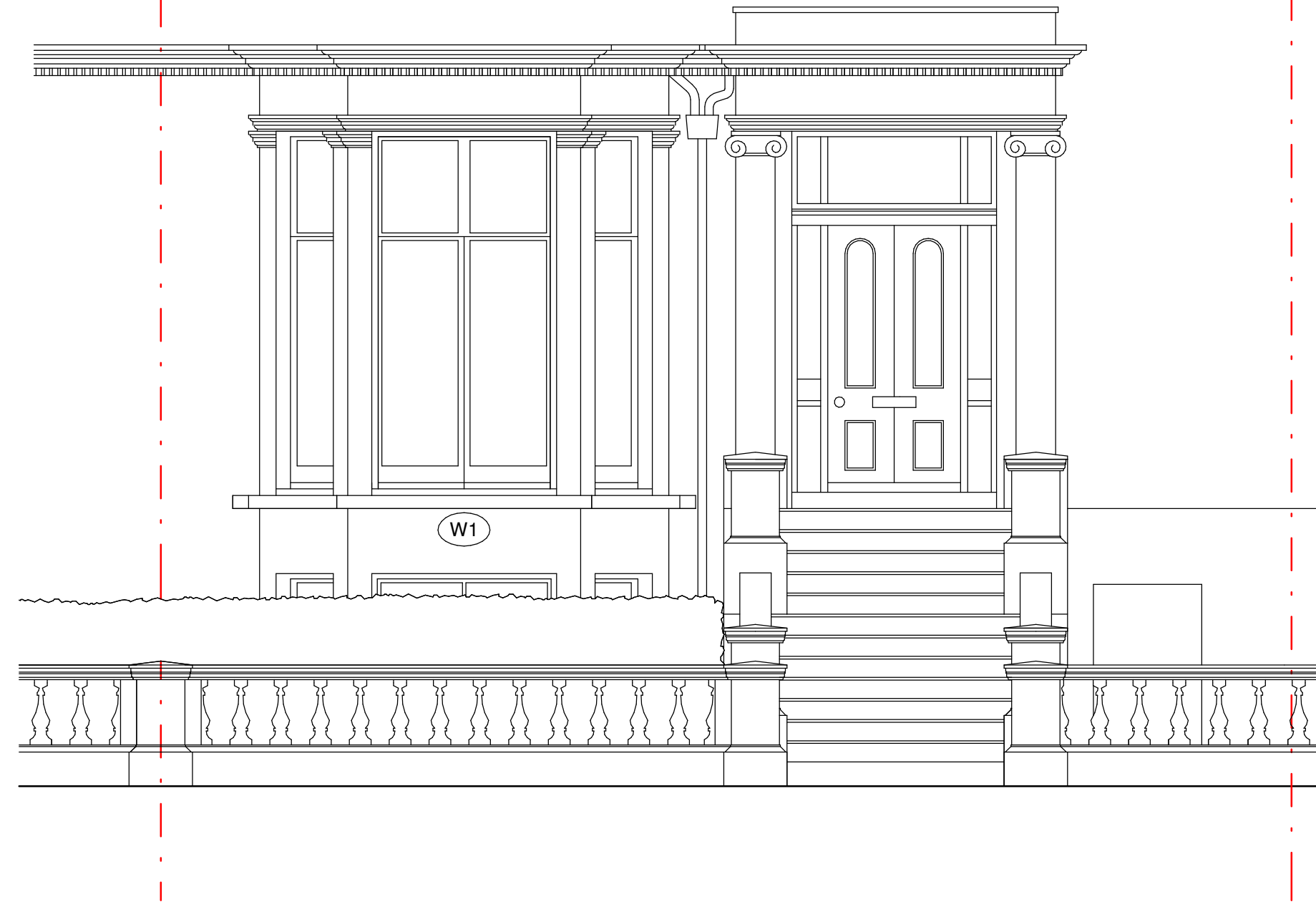
1 Proposed Front Elevation 1 : 50