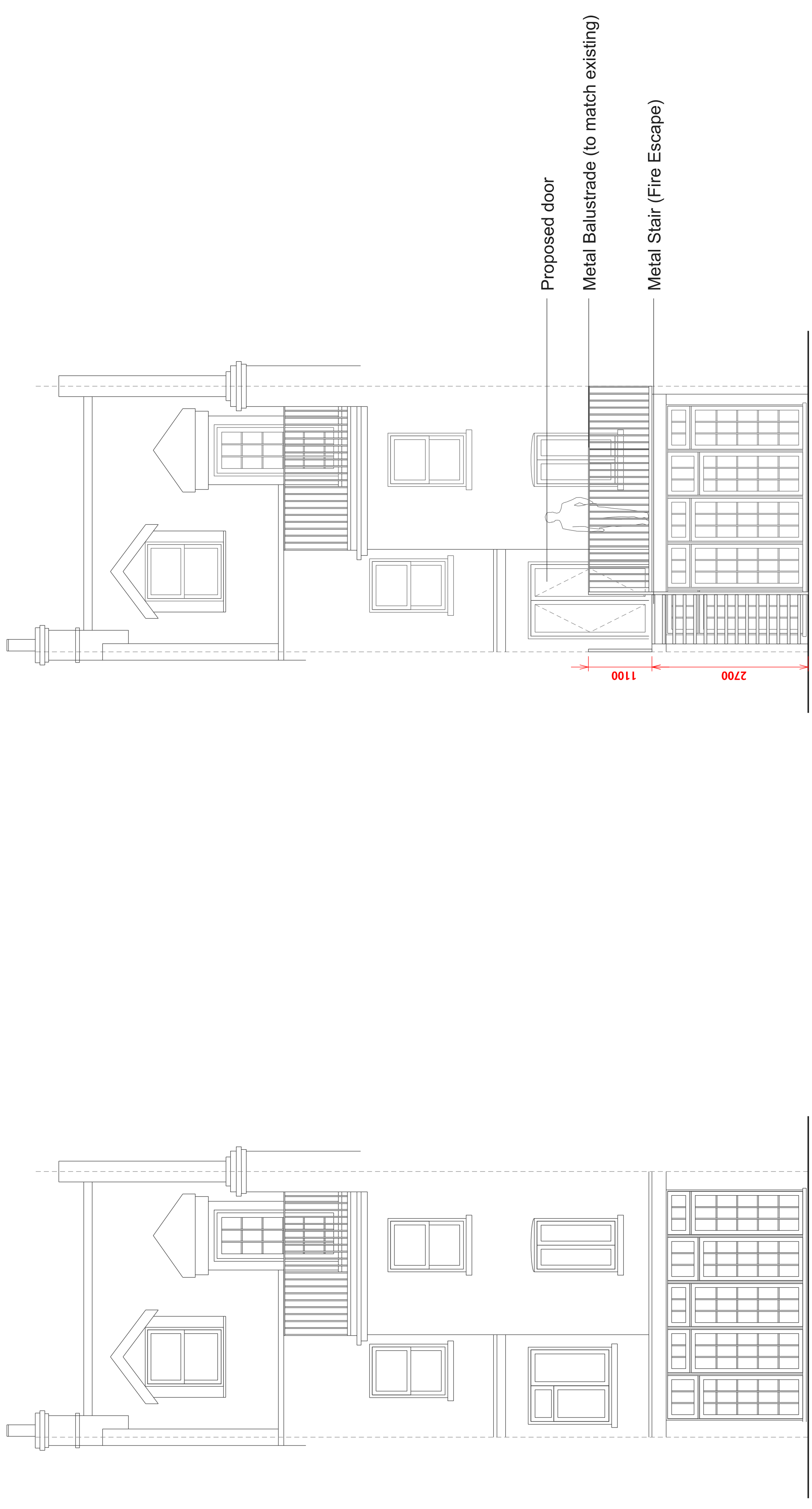
REAR ELEVATION _ PROPOSAL

Notes Do not scale from this drawing. All dimensions are based on site by the contractor and are subject to change. The architect is not responsible for any errors or omissions and such dimensions to be the responsibility of the contractor. Report all drawing errors, omissions and discrepancies to the architect.