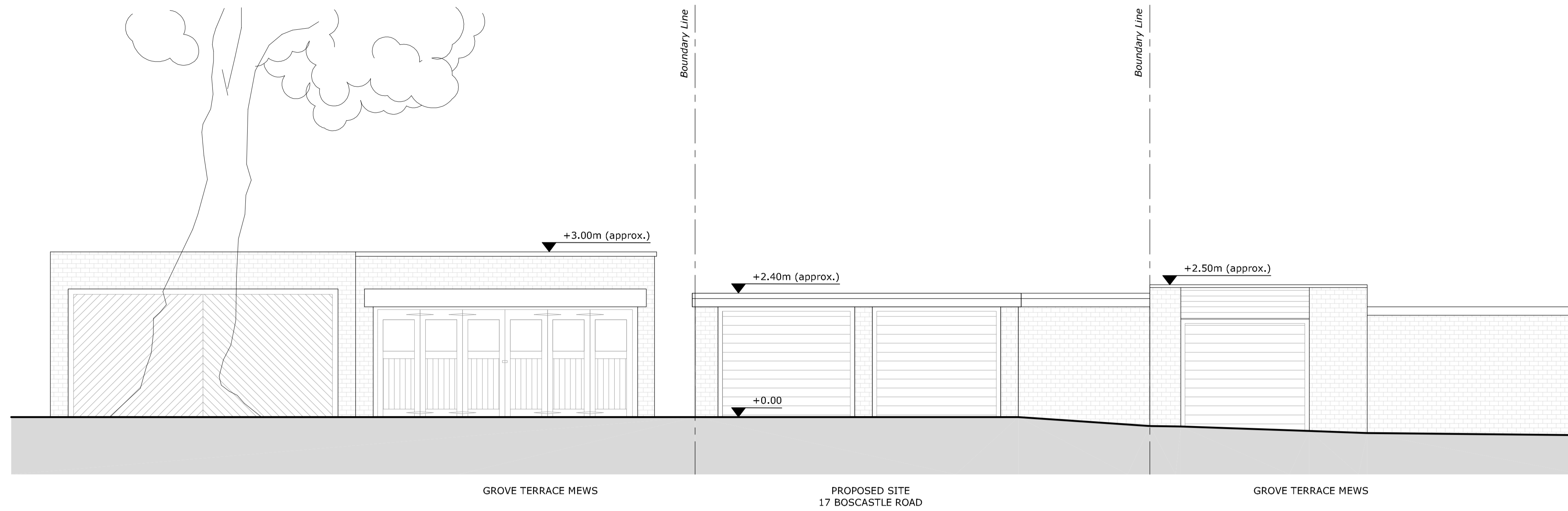
1 EXISTING ELEVATION 1 1:50