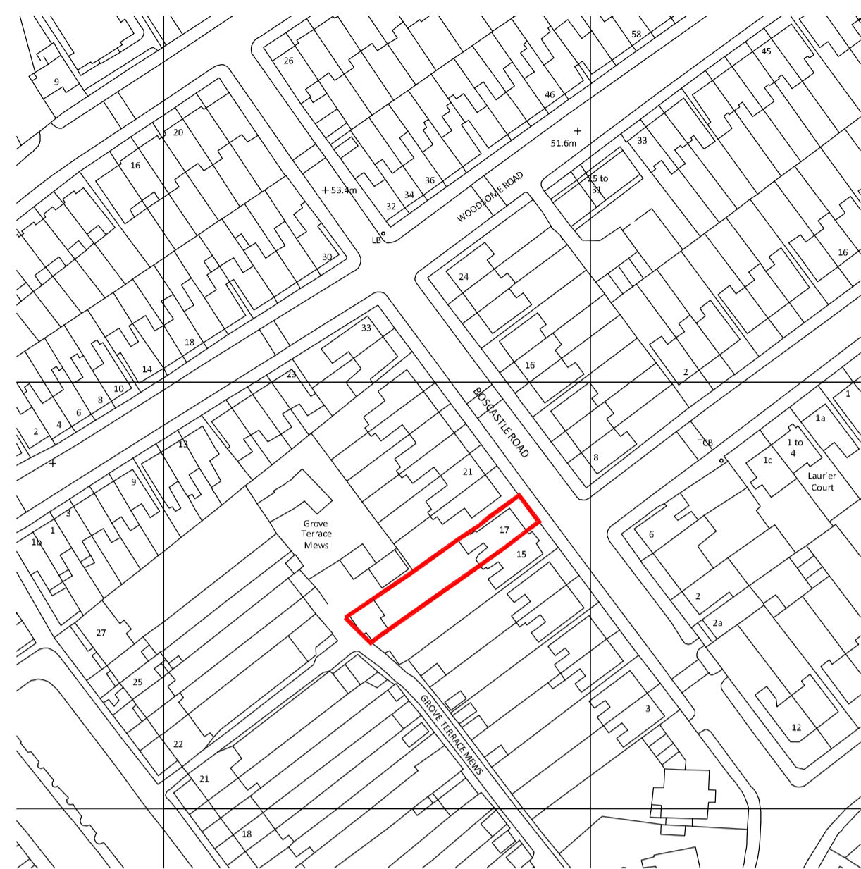
1 LOCATION PLAN 1:1250