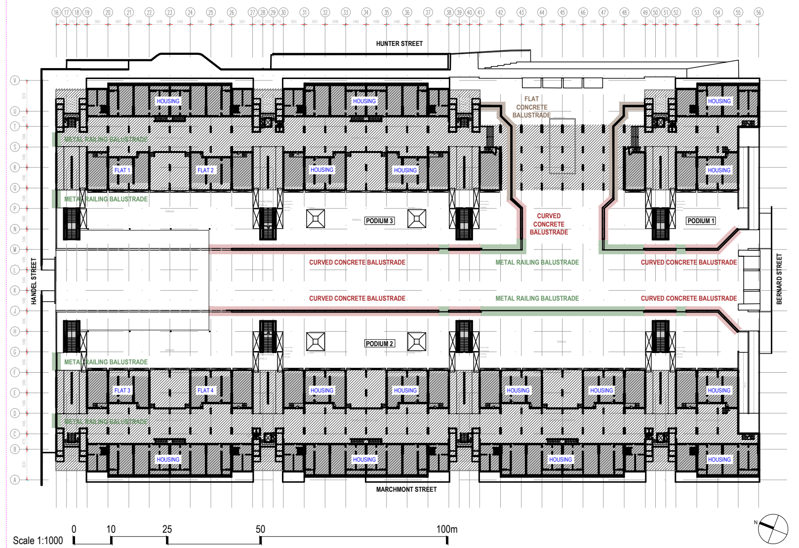
[02] EXISTING LEVEL C (PODIUM) FLOOR PLAN - BALUSTRADE TYPES