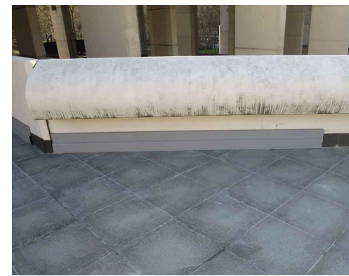
CURVED CONCRETE BALUSTRADE (to be as existing)