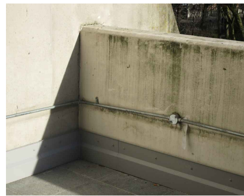
FLAT CONCRETE BALUSTRADE