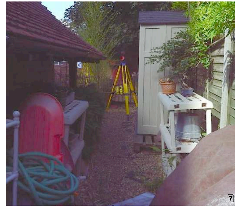
NORTH-WEST SIDE PASSAGE