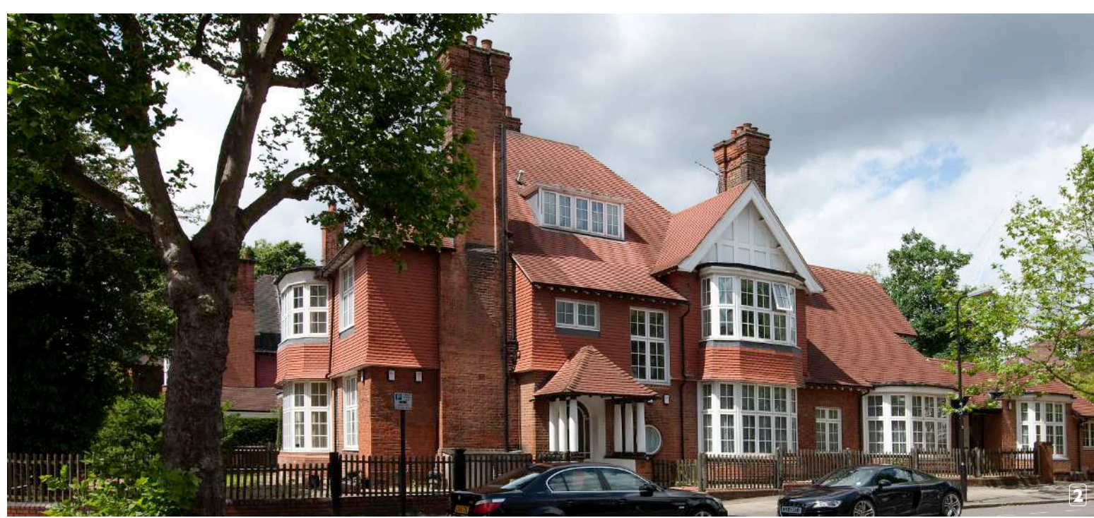
EAST-MAIN FACADE - WADHAM GARDENS