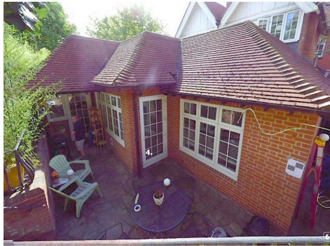
NORTH-WEST BACK TERRACE