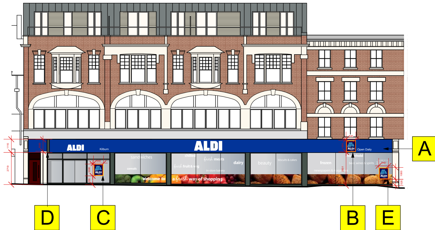
PROPOSED WEST ELEVATION (KILBURN HIGH ROAD STREET SCENE)