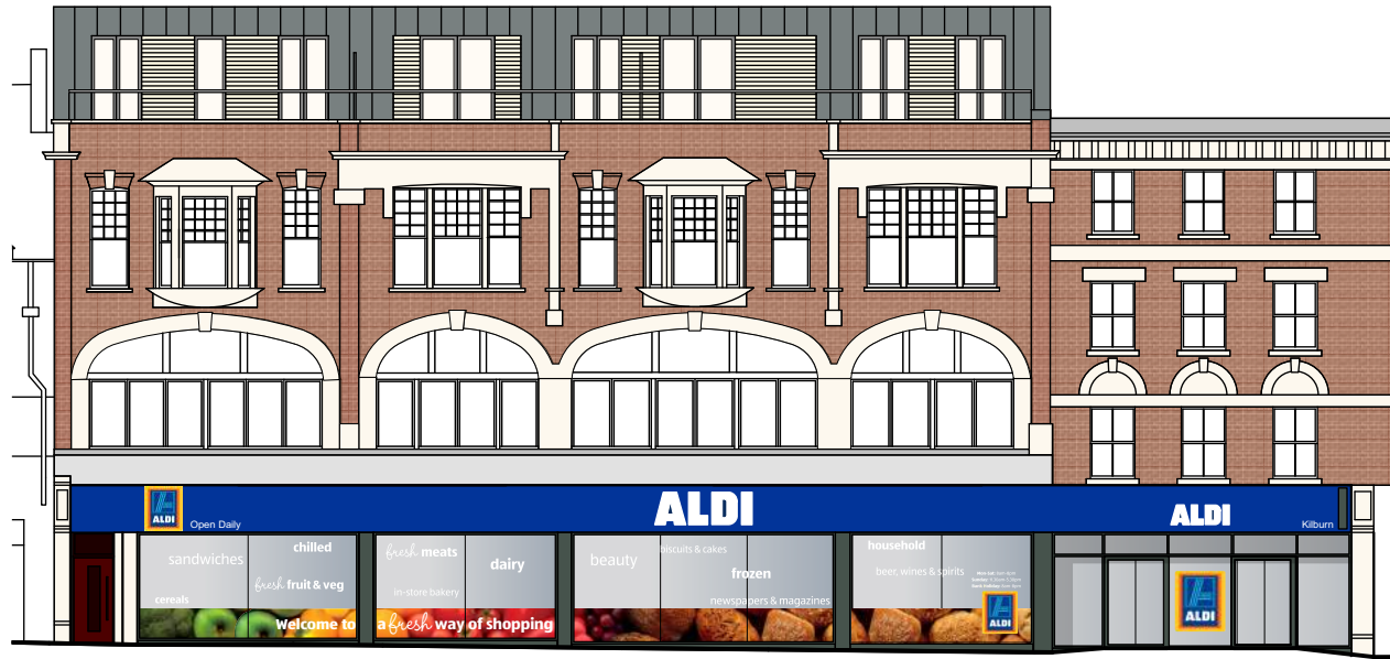
EXISTING WEST ELEVATION (KILBURN HIGH ROAD STREET SCENE)