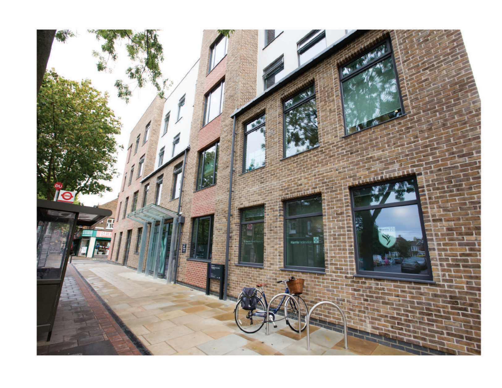
PPC Aluminium Windows