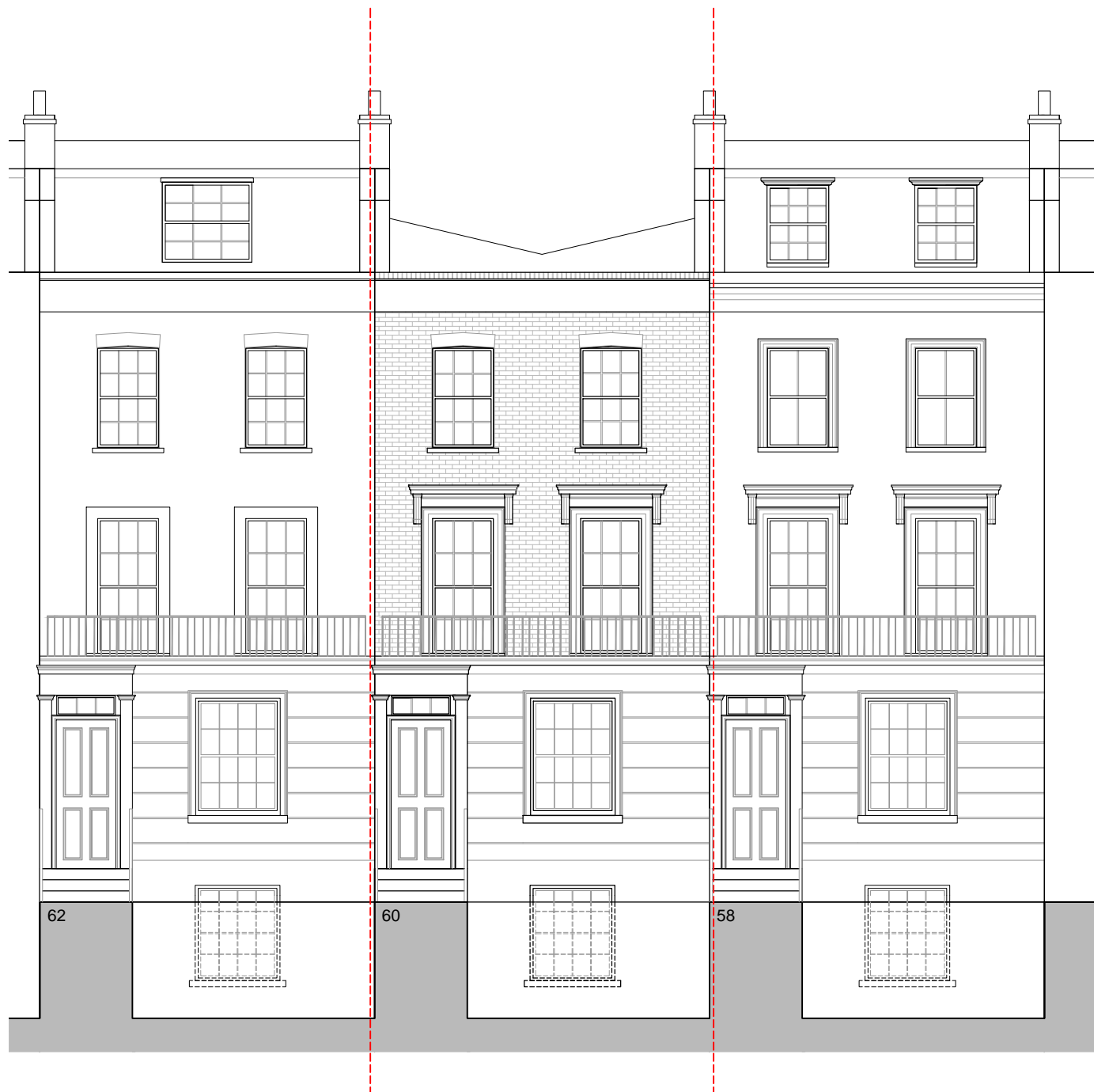
1 Proposed Elevation Delancey Street - Front South Elevation