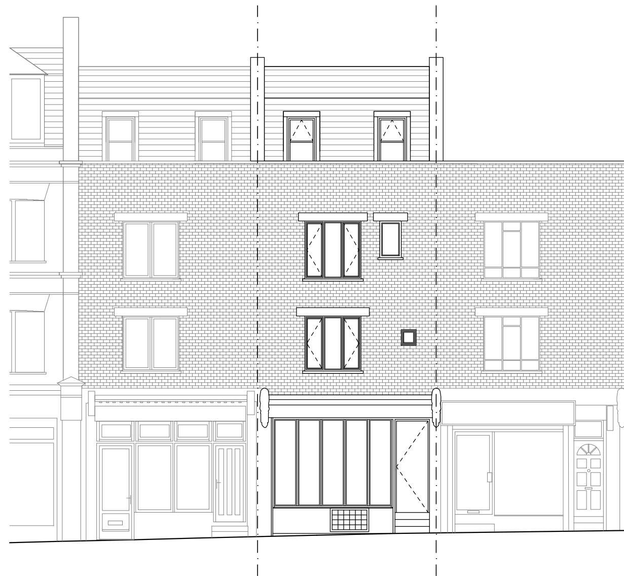
Front Elevation as Approved Scale 1:100