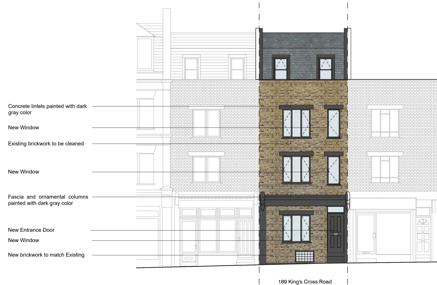
Front Elevation as Proposed Scale 1:100