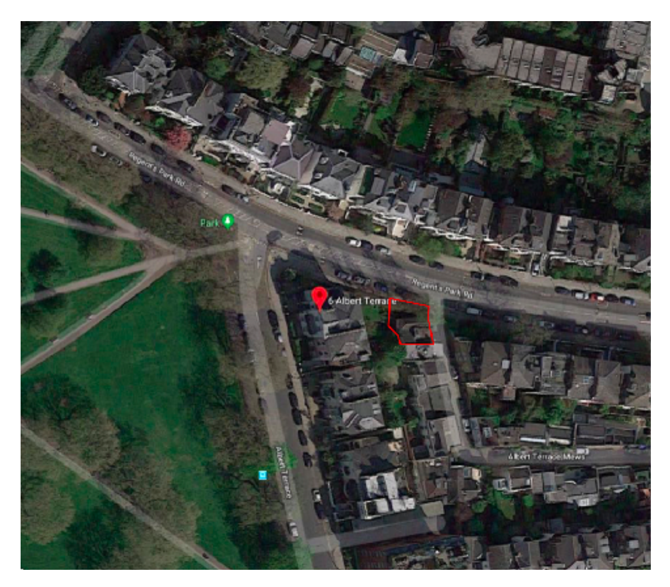
Aerial View of 6 Albert Terrace

side extension. It's exterior appearance might indicate that it was extended in the early 20th Century.