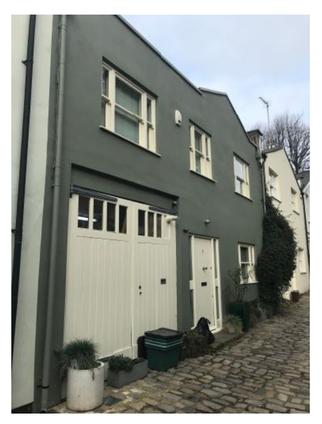
Original garage door at No. 3 Albert Terrace Mews

3.6 Over time Albert Terrace Mews was extended to 16 Mews properties - the newer additions provided provided more varied 2-storey buildings and the more recent buildings have introduced a wide variety of styles.