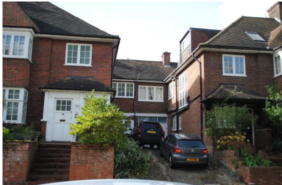
Image: 73 and 74 Lawn Road -two storey extensions