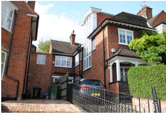
Image: No. 82 Lawn Road, two storey side extension