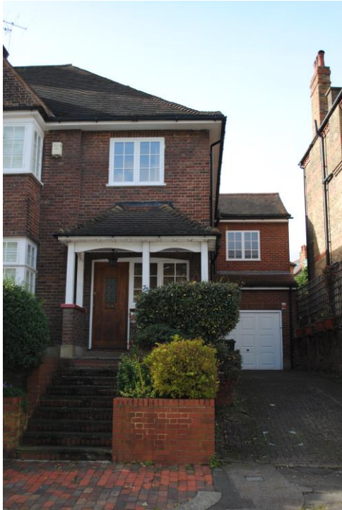
Image of No. 72 Lawn Road - Part single part two storey side extension