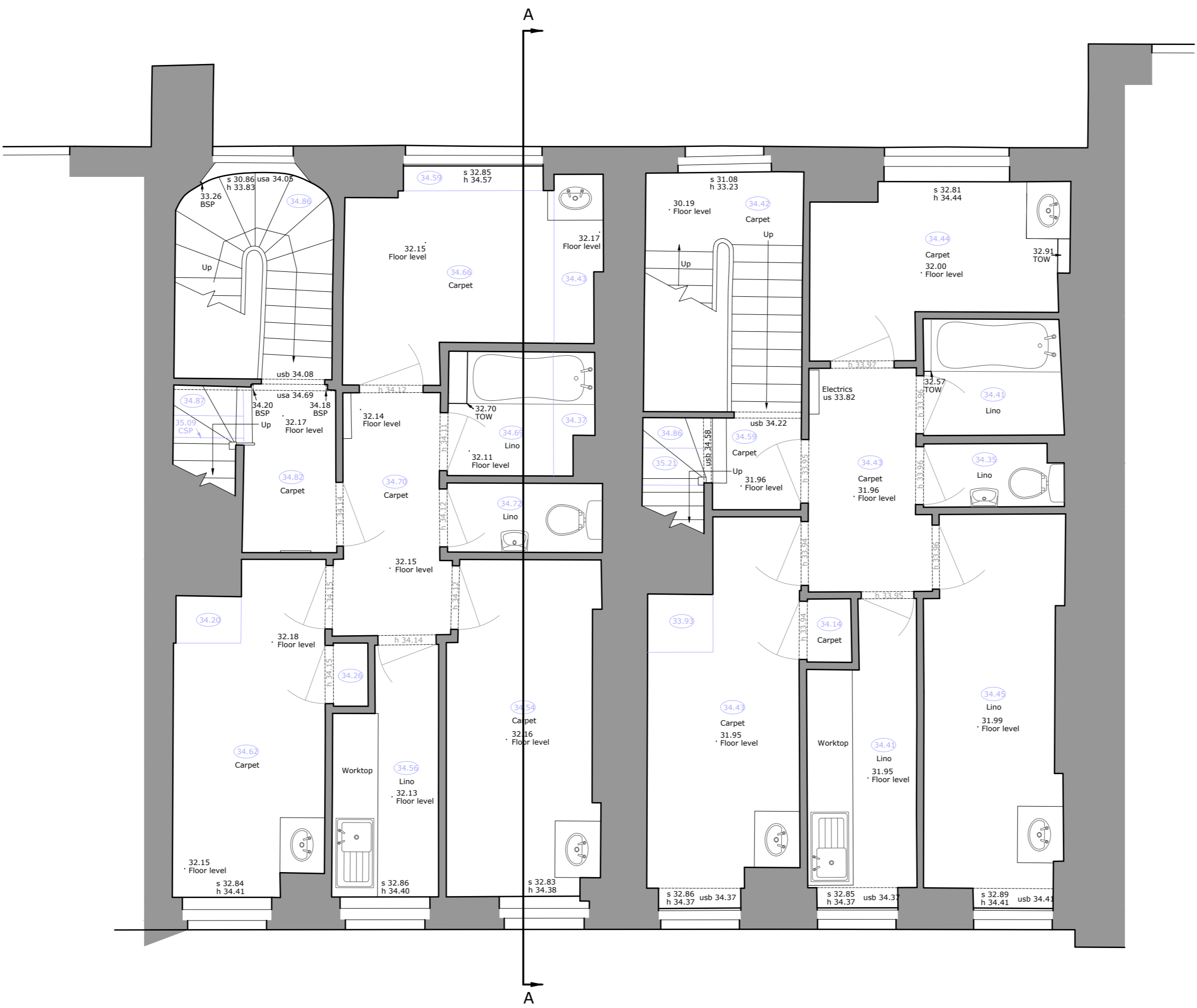
1 SECOND FLOOR PLAN Scale: 1:50 @ A1