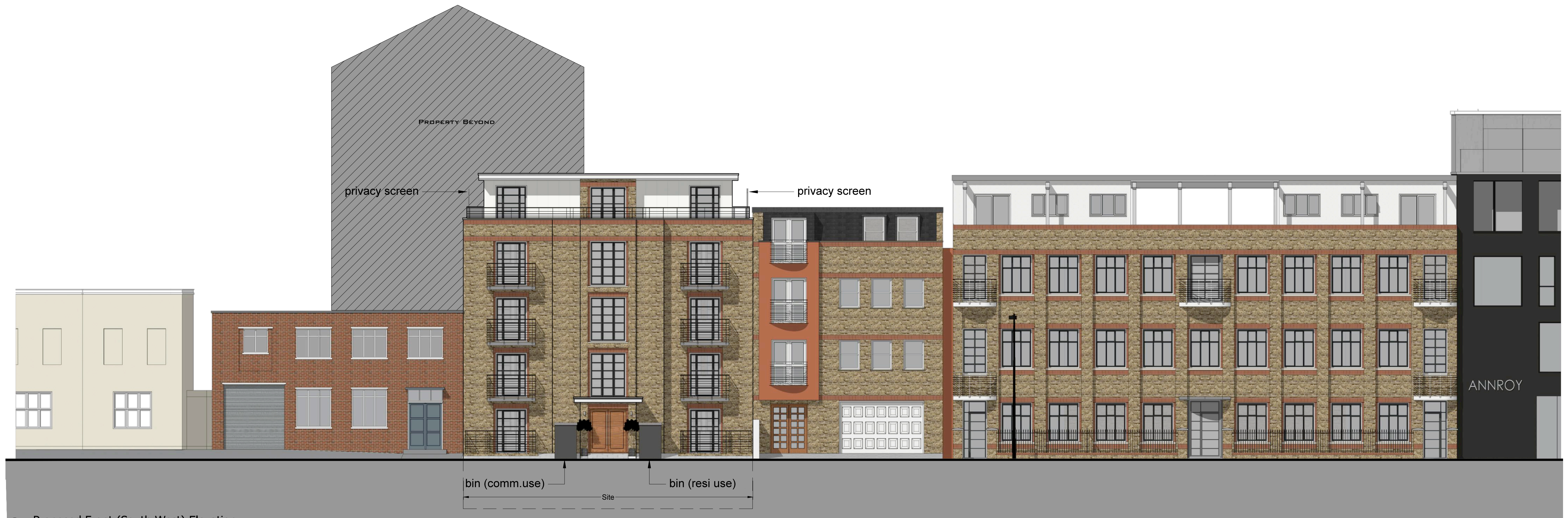
1 Proposed Front (South West) Elevation