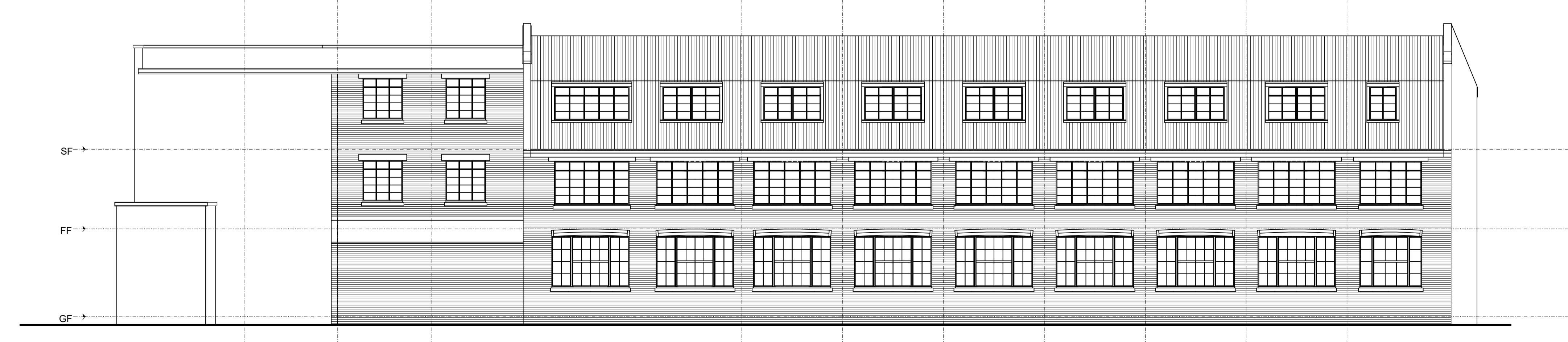
EXISTING FLANK ELEVATION