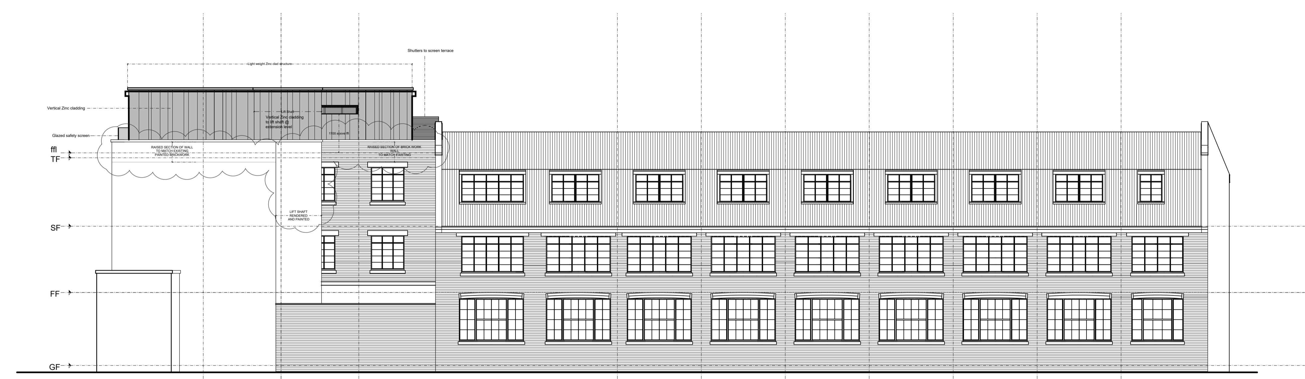
PROPOSED FLANK ELEVATION SOUTH WEST