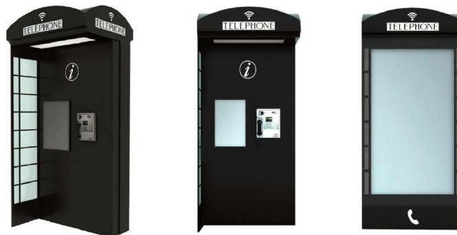
Proposed replacement Telephone Kiosk

23. ... I am satisfied the proposed kiosk would perform a public function”.