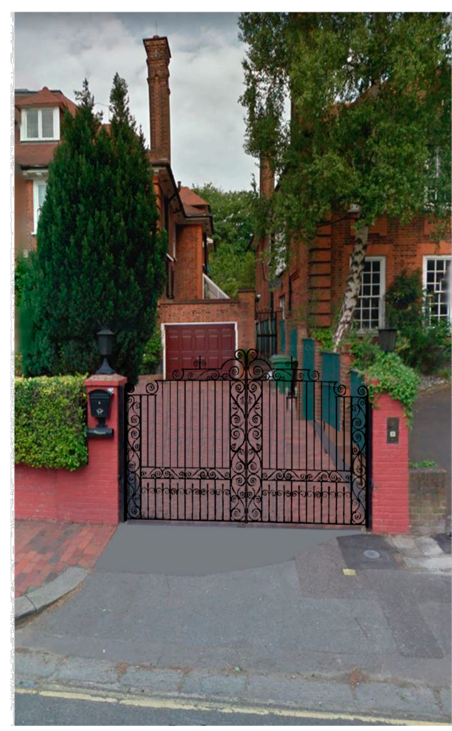
3 Proposed Front Gate

General notes Copyright owned by smok. Do not scale from this drawing. All dimensions are to be checked on site prior to commencing the construction of any element of the works or manufacture of any elements. Any discrepancies between the drawing and site conditions/dimensions, any errors or omissions are to be brought to the attention of the architect for clarification prior to proceeding with construction of the element of work. All dimensions are in millimeters. All construction to comply with all current British Standards and Building Regulations requirements.