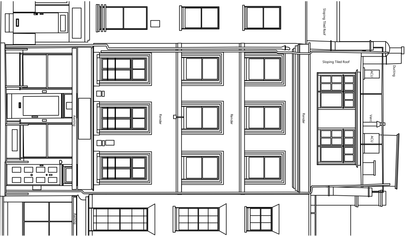
49,000m AD Front Elevation