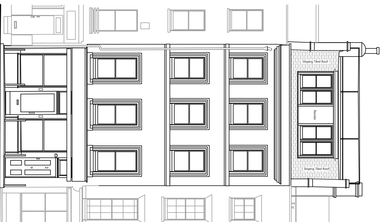
49,000m AD Front Elevation as Proposed