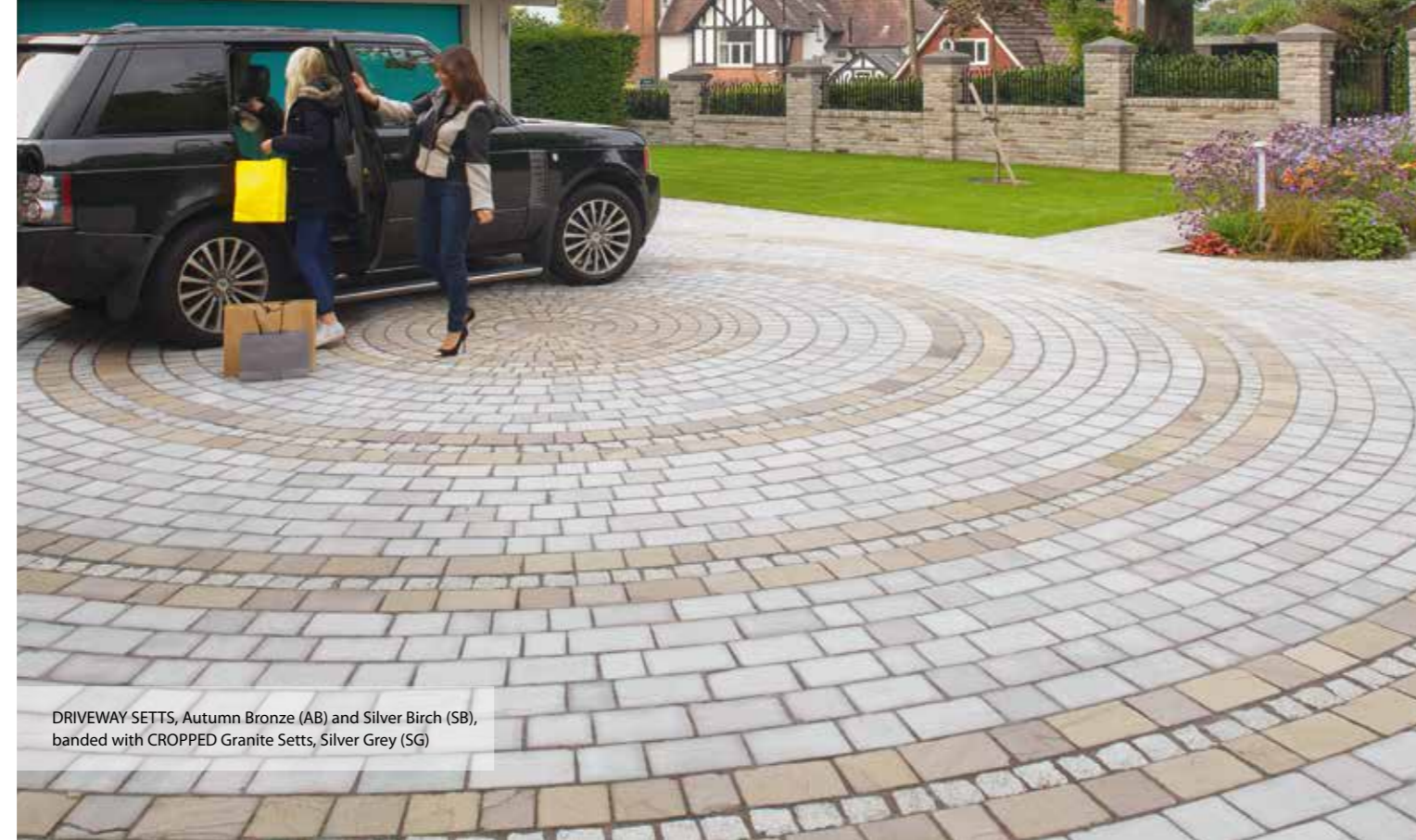
DRIVEWAY SETTS, Autumn Bronze (AB) and Silver Birch (SB), banded with CROPPED Granite Setts, Silver Grey (SG)

For more product notes see p190 or website