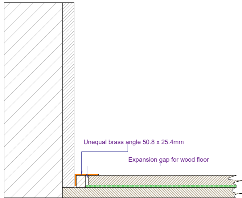
FLOORING SECTION - SHOWING FLOOR EDGE DETAIL