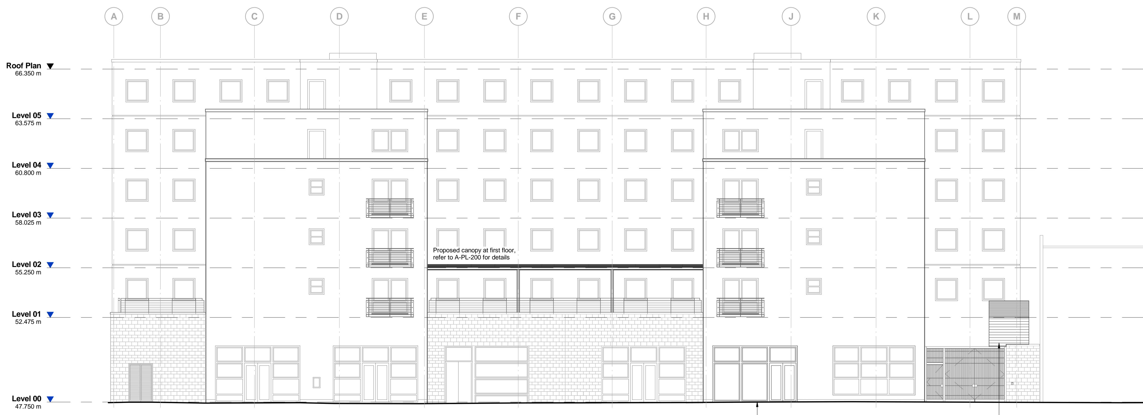
2 Proposed South Elevation 1:100