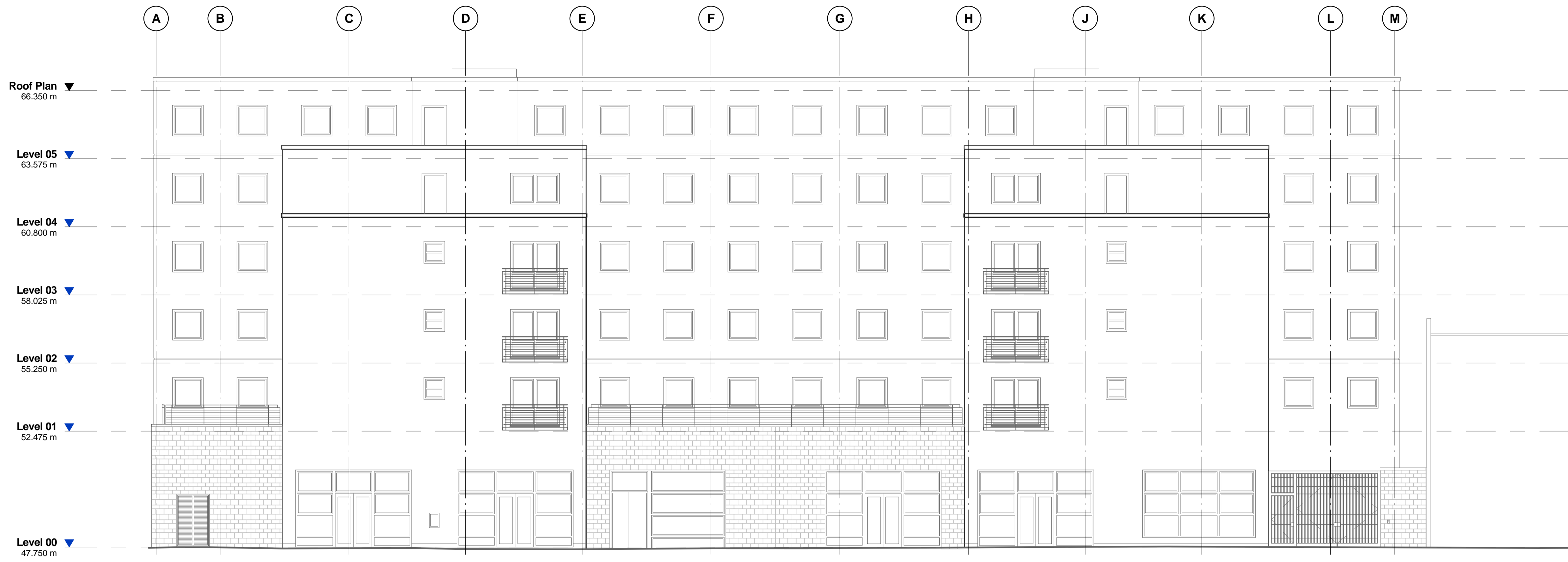
1 Existing South Elevation 1:100