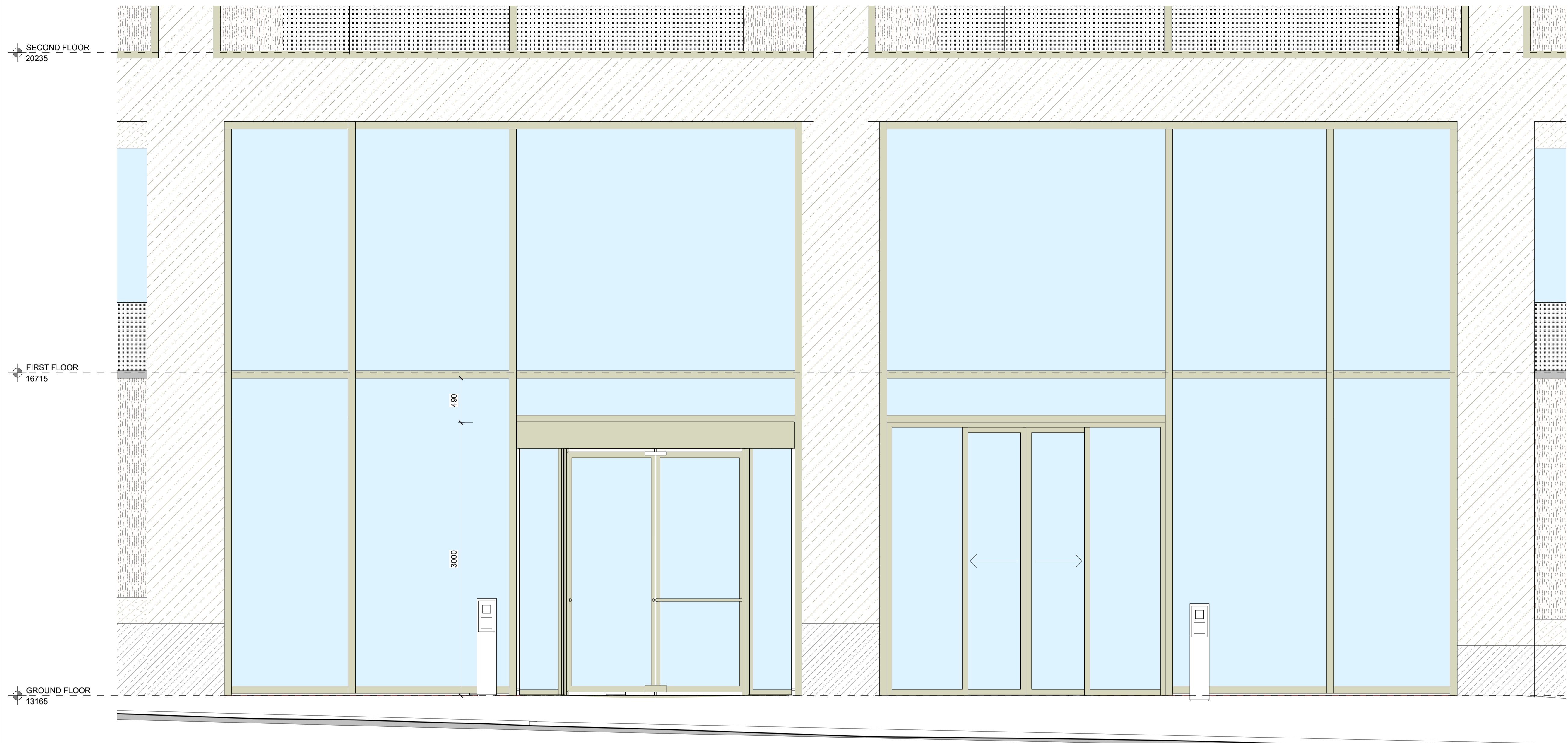
1 ENTRANCE DOORS ELEVATION - REVISED PROPOSAL 1 : 25