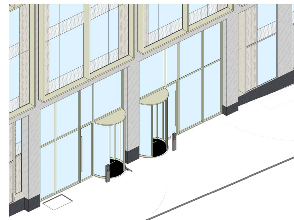
3 3D - ENTRANCE WITHOUT BOLLARDS