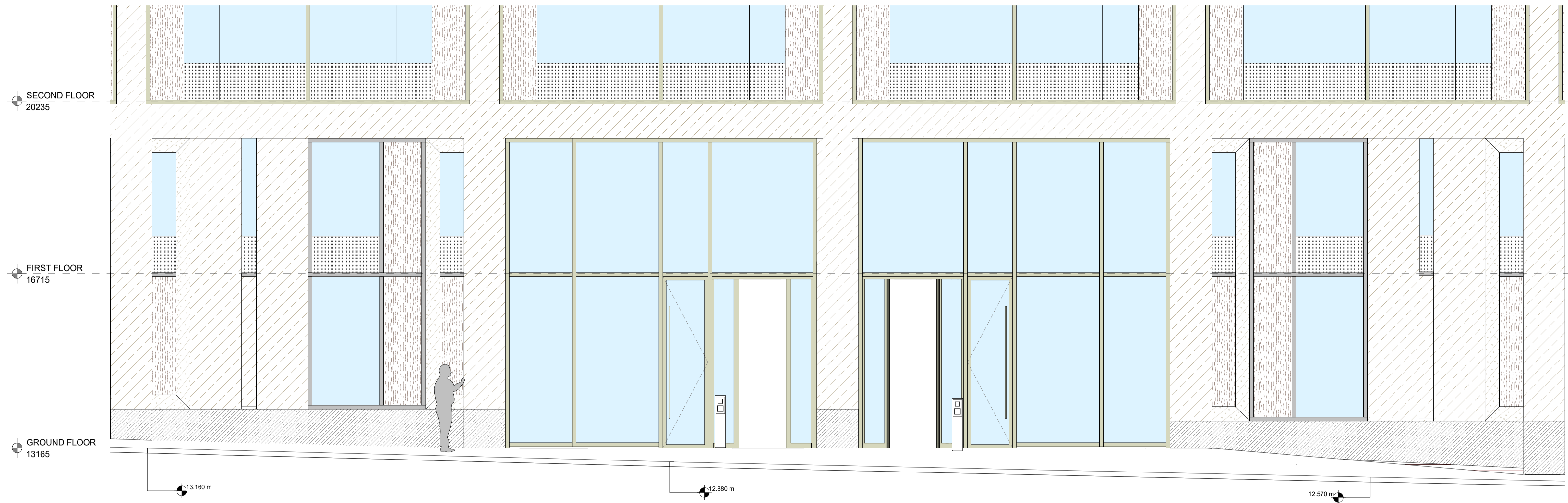
1 ELEVATION - ENTRANCE WITHOUT BOLLARDS - SCHEME AS APPROVED 1 : 50