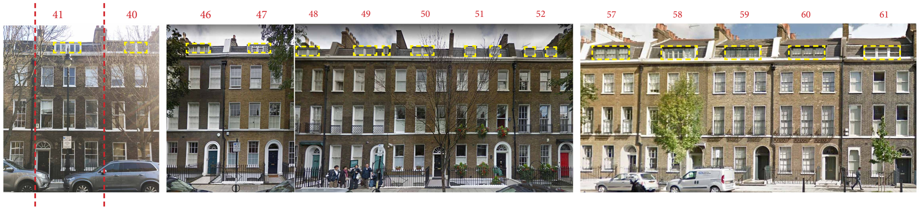
Properties along 41 Doughty street --- Applicant's site