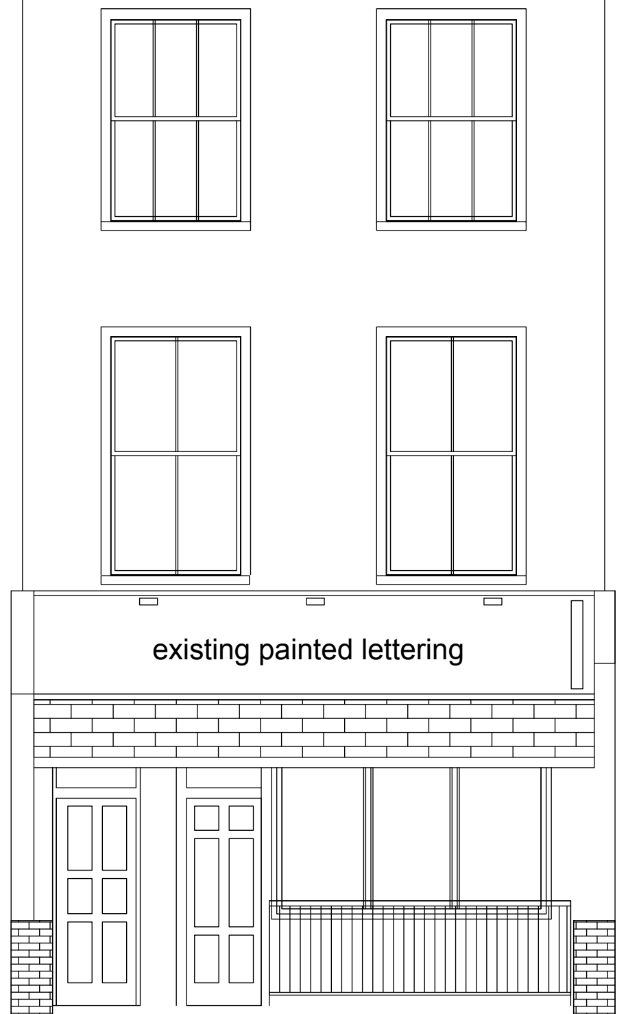
B EXISTING ELEVATION S205 1:50