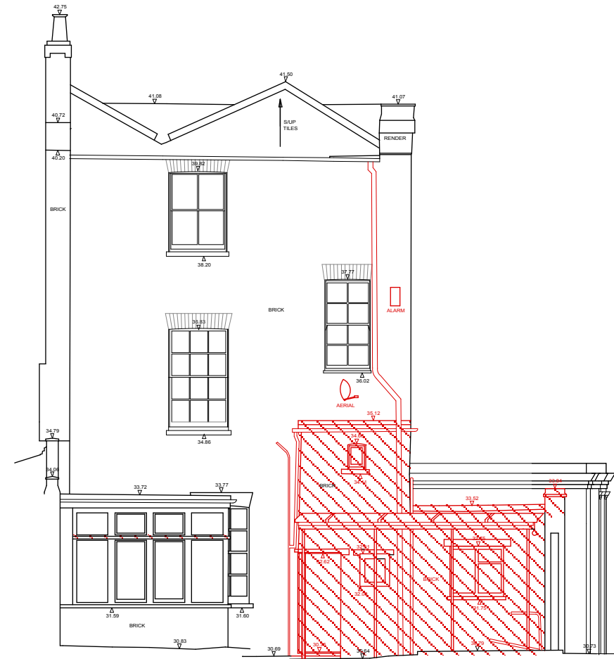
ELEVATION 1:100 INDICATING DEMOLITION