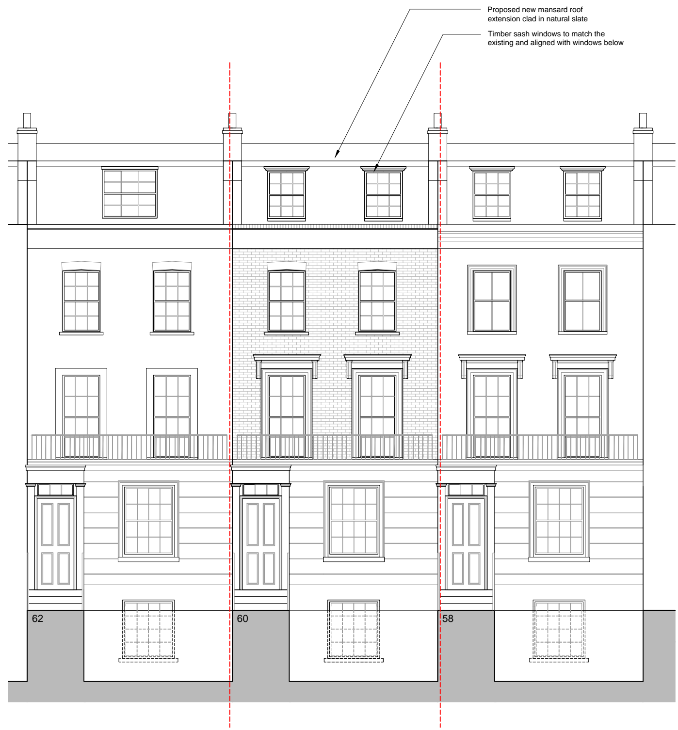
1 Proposed Elevation Delancey Street - Front South Elevation