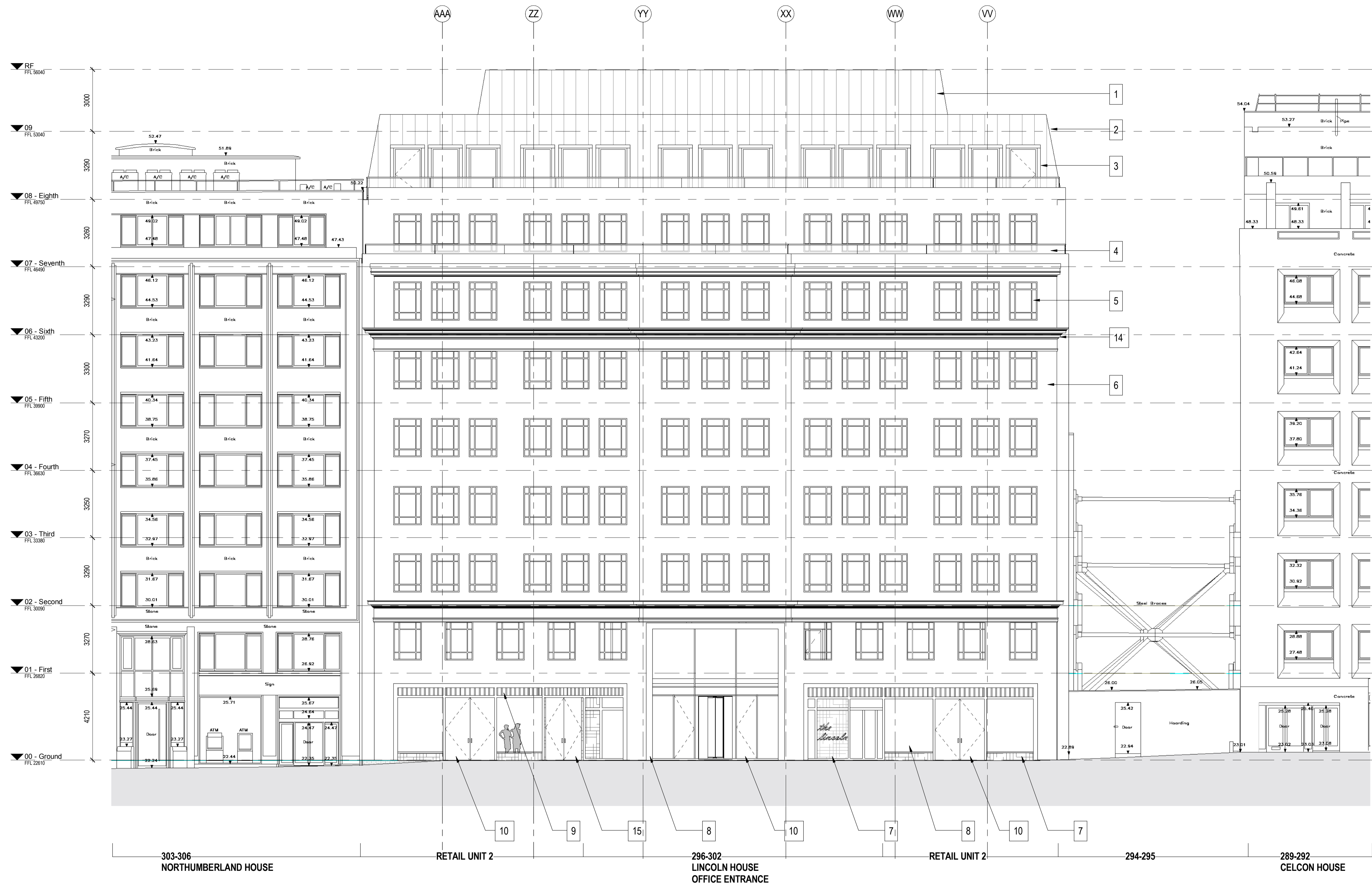
1 North Elevation 1:100

303-306 NORTHUMBERLAND HOUSE RETAIL UNIT 2 296-302 LINCOLN HOUSE OFFICE ENTRANCE RETAIL UNIT 2 294-295 289-292 CELCON HOUSE