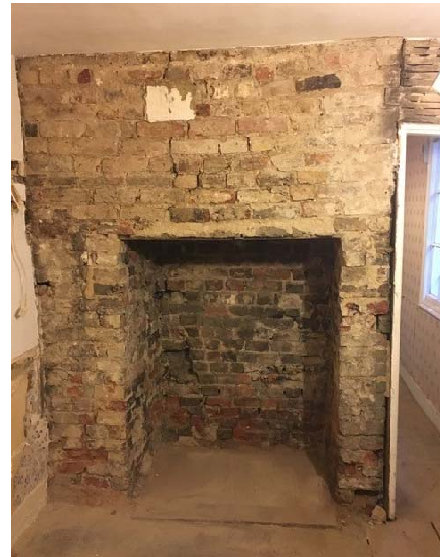
4 PHOTO OF EXISTING Elevation from kitchen