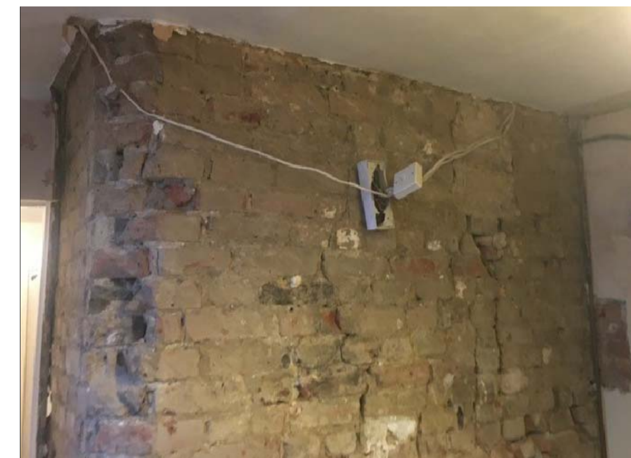
5 PHOTO OF EXISTING Elevation from sink room (upper portion)