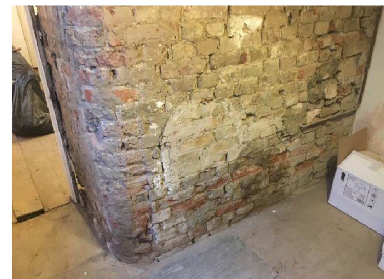
6 PHOTO OF EXISTING Elevation from sink room (lower portion)