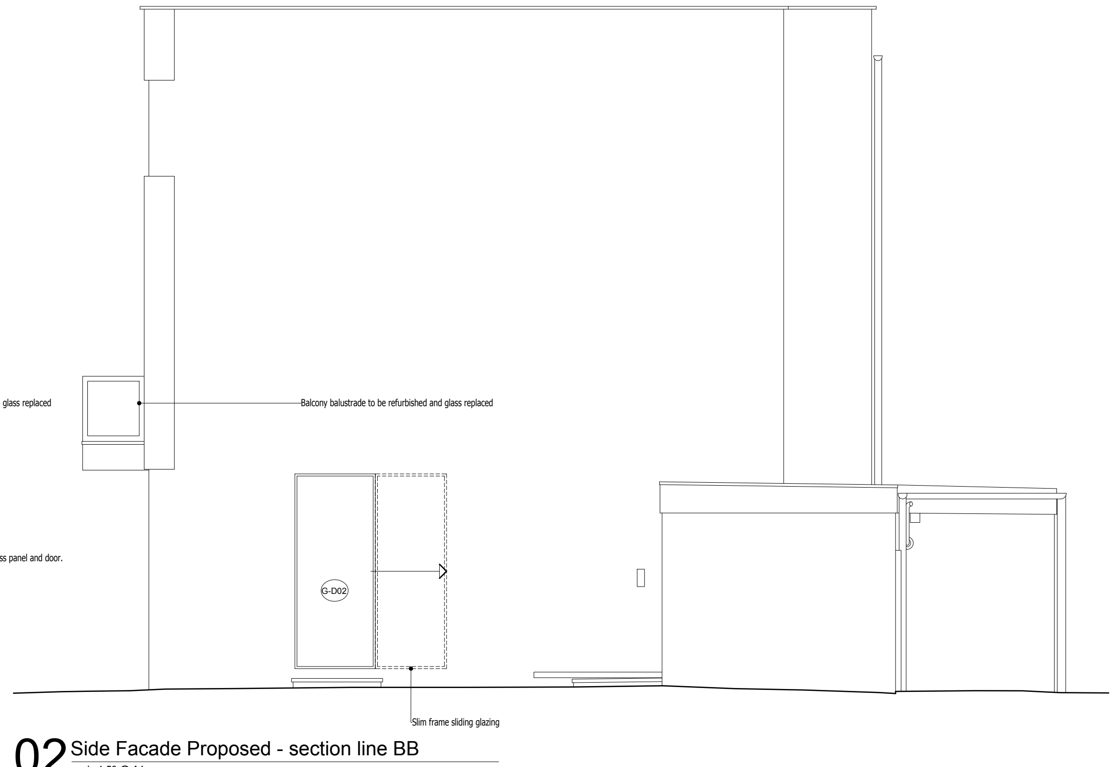
02 Side Facade Proposed - section line BB scale 1:50 @ A1