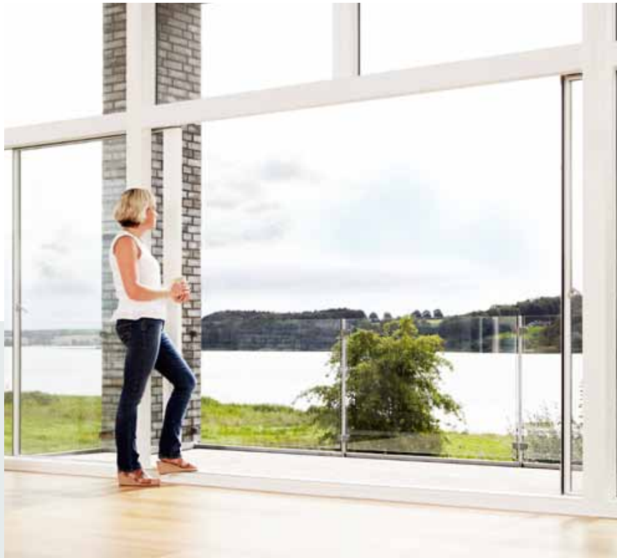
SLIM FRAME | GOOD ENERGY