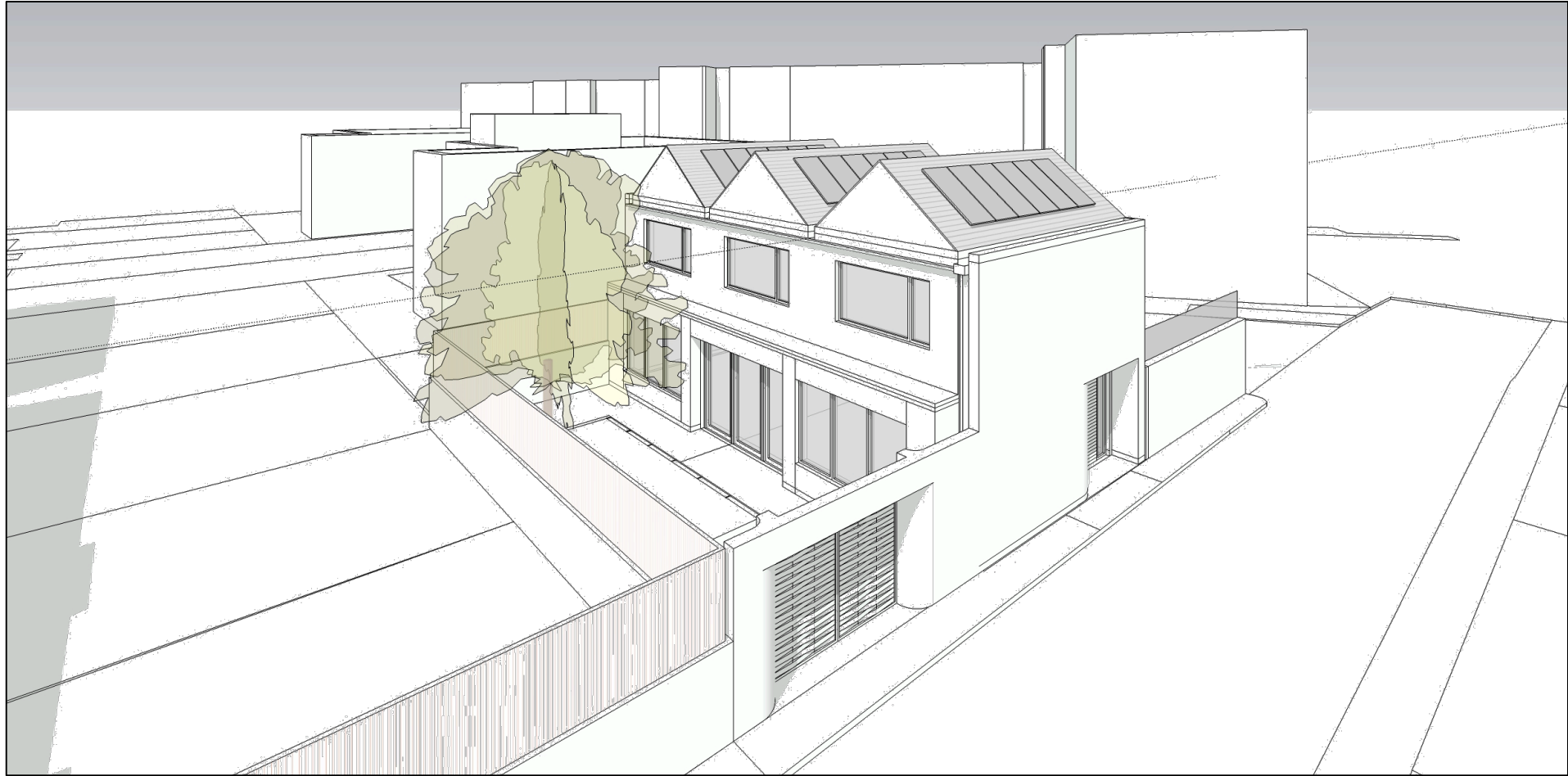
01 VIEW FROM THE SOUTHWEST