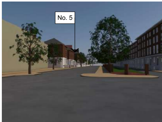
3D PROPOSED IMAGE A