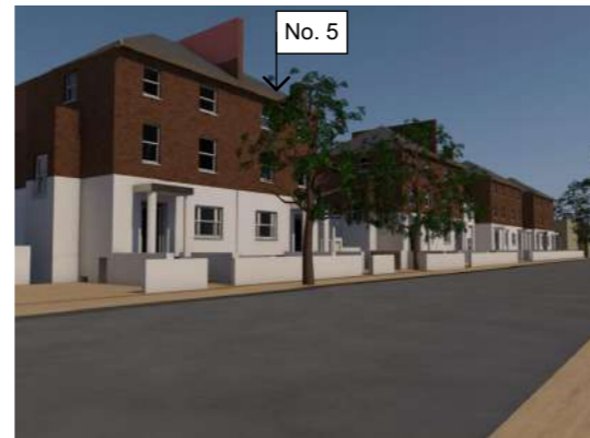
3D PROPOSED IMAGE C