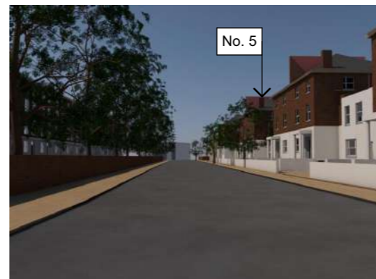
3D EXISTING H