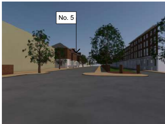
3D EXISTING A