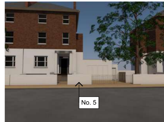
3D PROPOSED IMAGE D