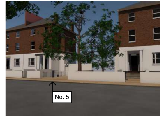
3D EXISTING E