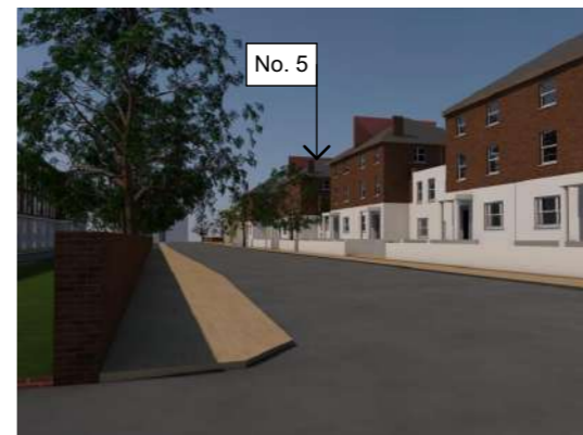
3D EXISTING I