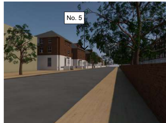
3D PROPOSED IMAGE B