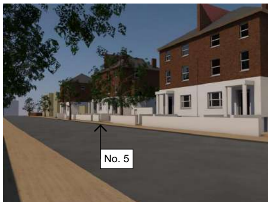
3D EXISTING F