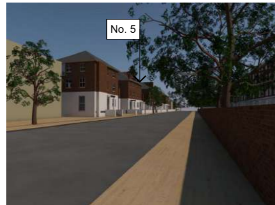
3D EXISTING B