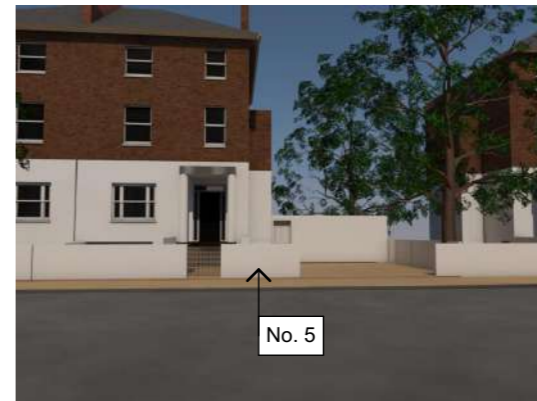
3D EXISTING D