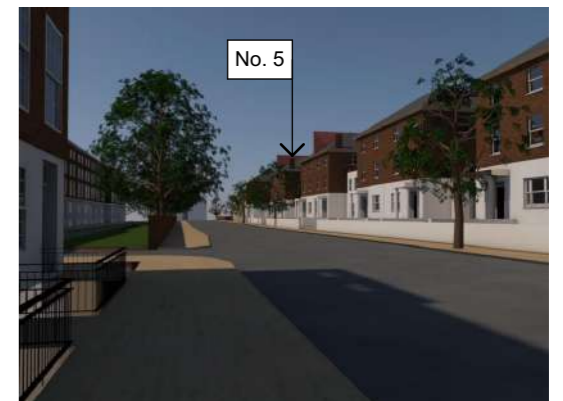
3D EXISTING J