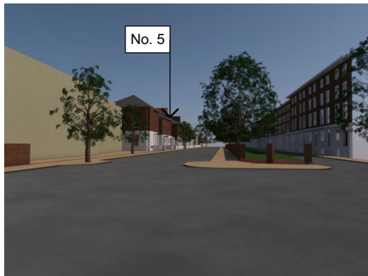
3D EXISTING A