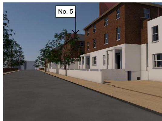
3D EXISTING G