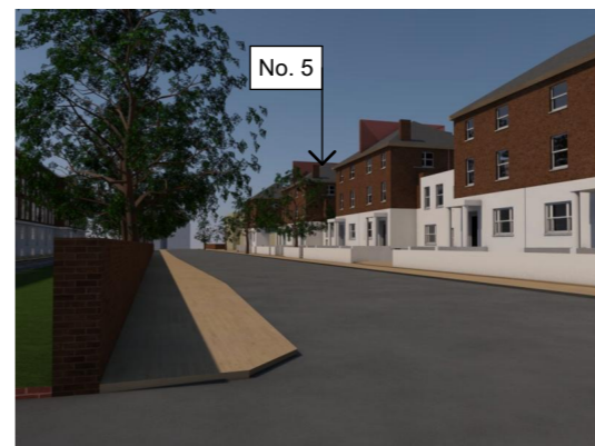
3D EXISTING I