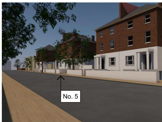
3D EXISTING F