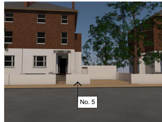
3D EXISTING D