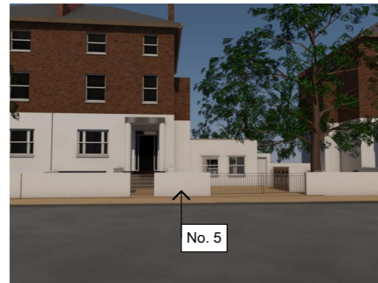
3D PROPOSED IMAGE D