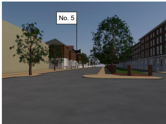
3D PROPOSED IMAGE A