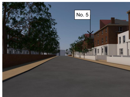
3D EXISTING H