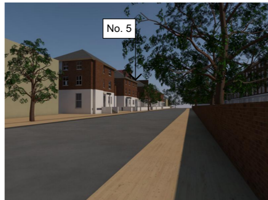
3D EXISTING B