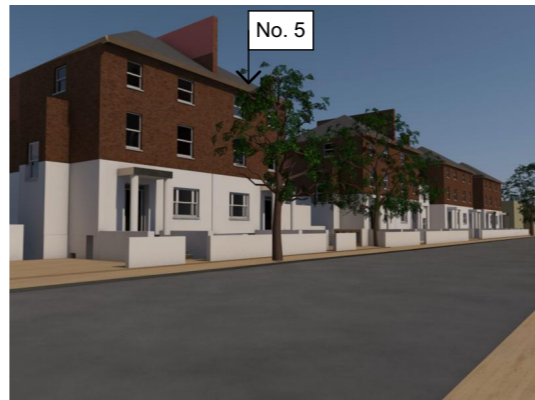
3D EXISTING C