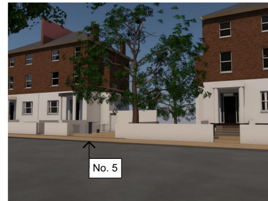
3D EXISTING E