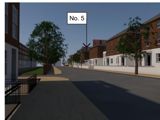
3D EXISTING J