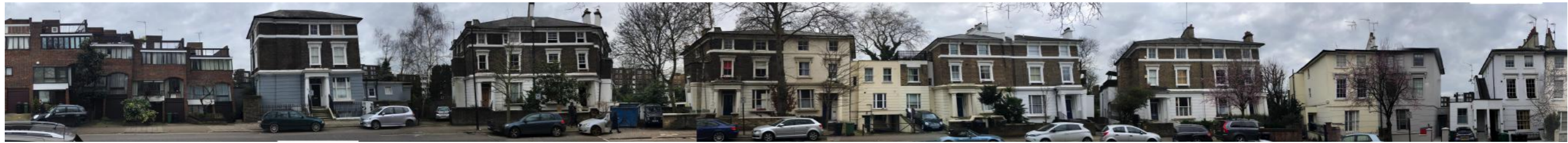
STITCHED STREET PHOTO