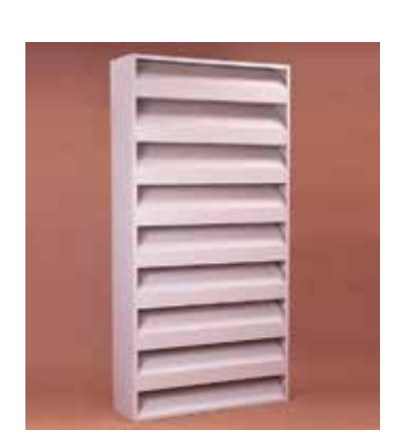
LAAC 30 Acoustic Louvre.