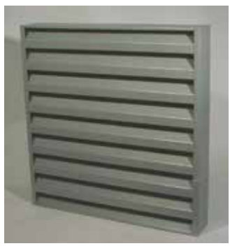
LAAC 15 Acoustic Louvre.