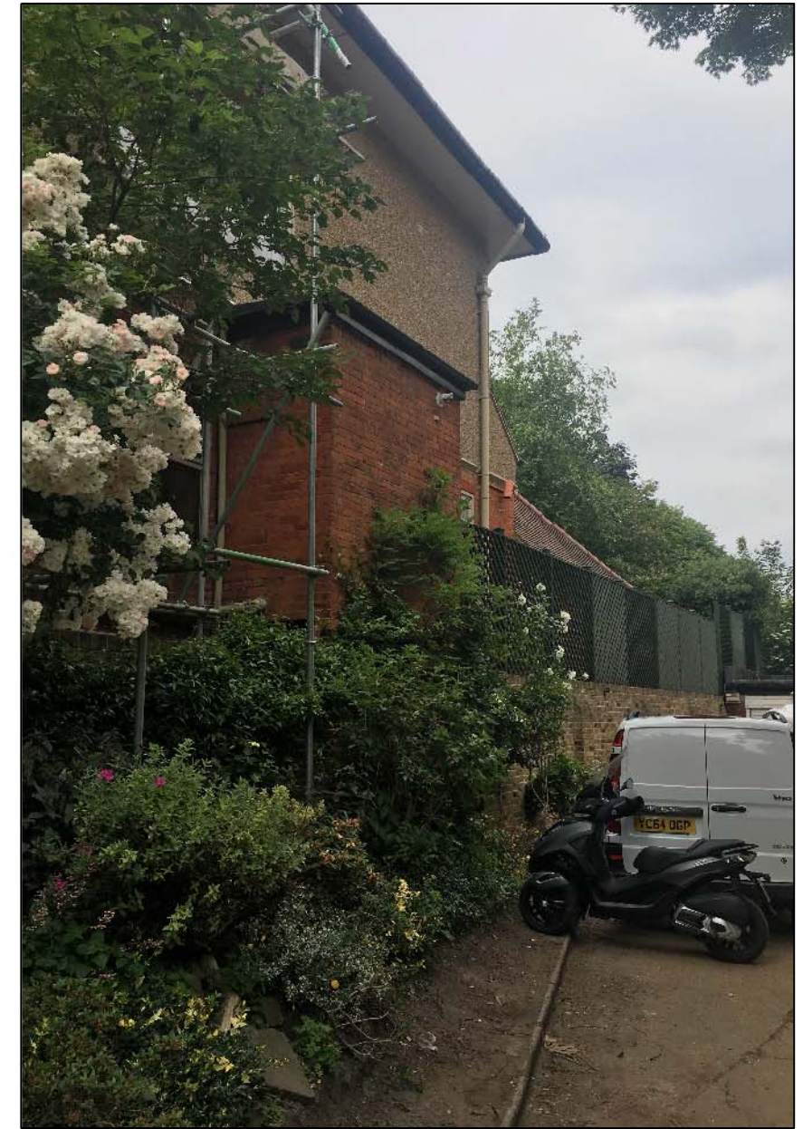
Side elevation from adjacent building (26 Wedderburn road)