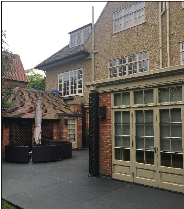
Existing rear addition