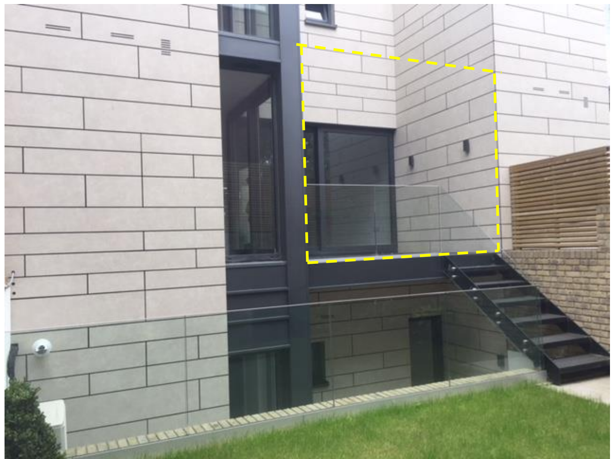
Photo.3 View back towards terrace indicating area of in fil extension.