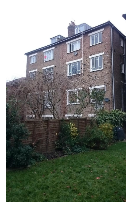
view to no. 4