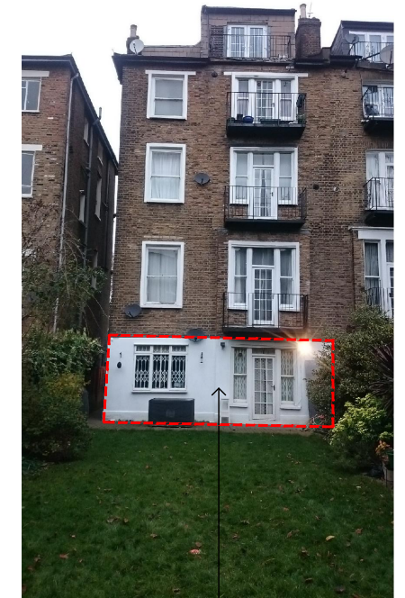
location of proposed rear extension