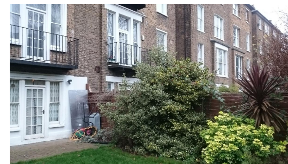
view to no. 8