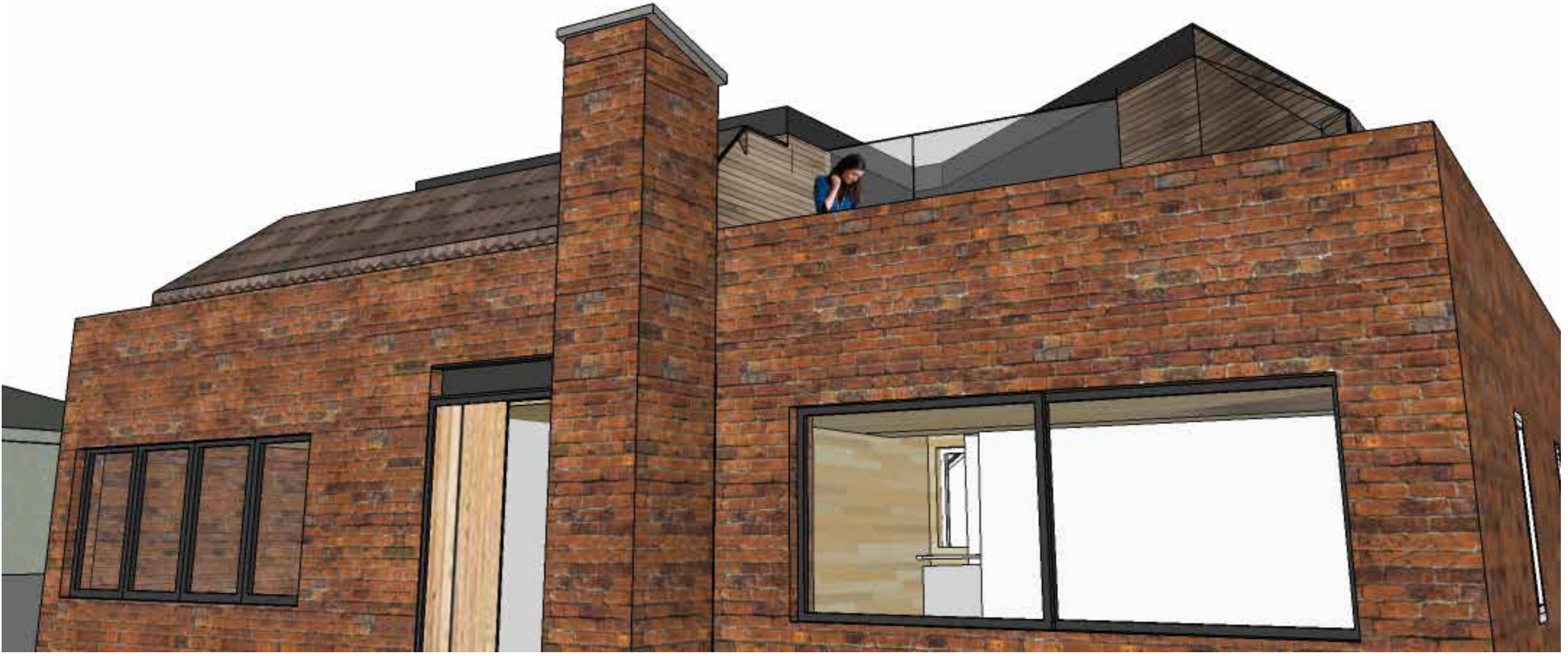
BALCONY VIEW - FRONT