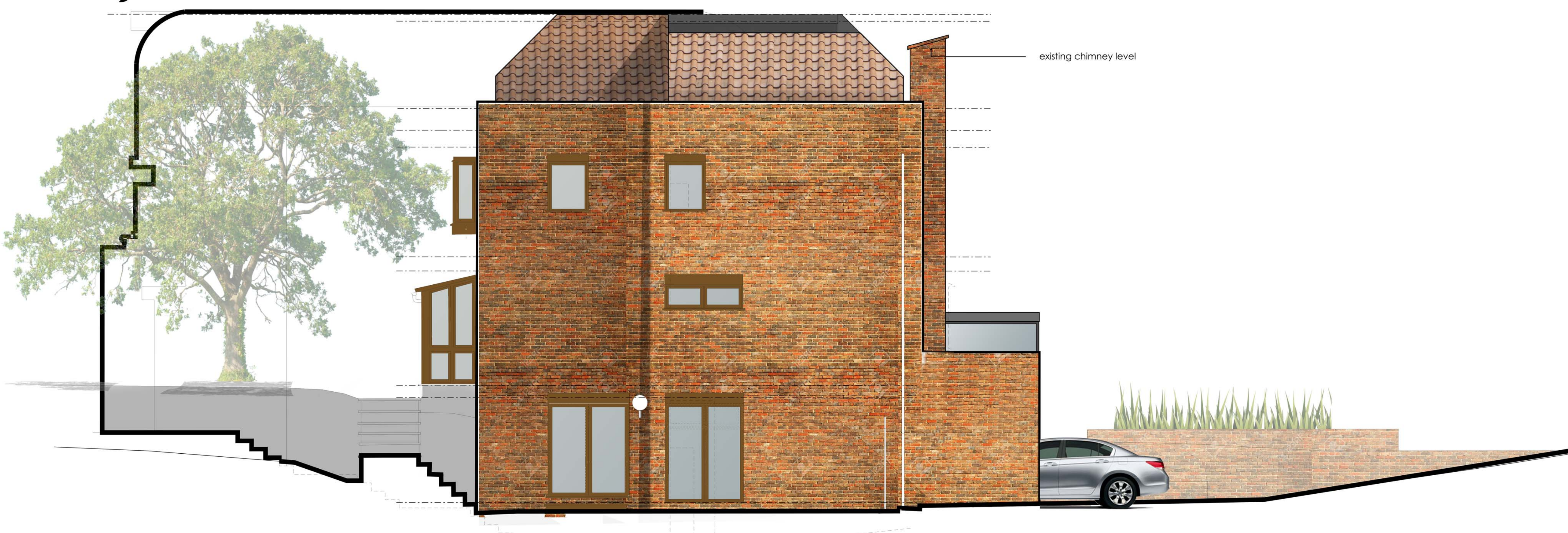
2. SIDE ELEVATION - GARAGE

NOTES: DO NOT SCALE FROM THIS DRAWING. WORK FROM THE INDICATED DIMENSIONS ONLY. ALL SITE DIMENSIONS TO BE VERIFIED BY CONTRACTOR AND ANY DISCREPANCIES REPORTED. ALL DIMENSIONS ARE MILLIMETERS UNLESS OTHERWISE STATED. ALL DIMENSIONS BE TO CHECKED ON SITE & MANUFACTURER TO PROVIDE SHOP DRAWINGS FOR CLIENT APPROVAL. METERAGE REQUIRED TO BE CONFIRMED BY MANUFACTURER & ALL MATERIALS TO BE SUITABLE FOR CONTRACT USE.