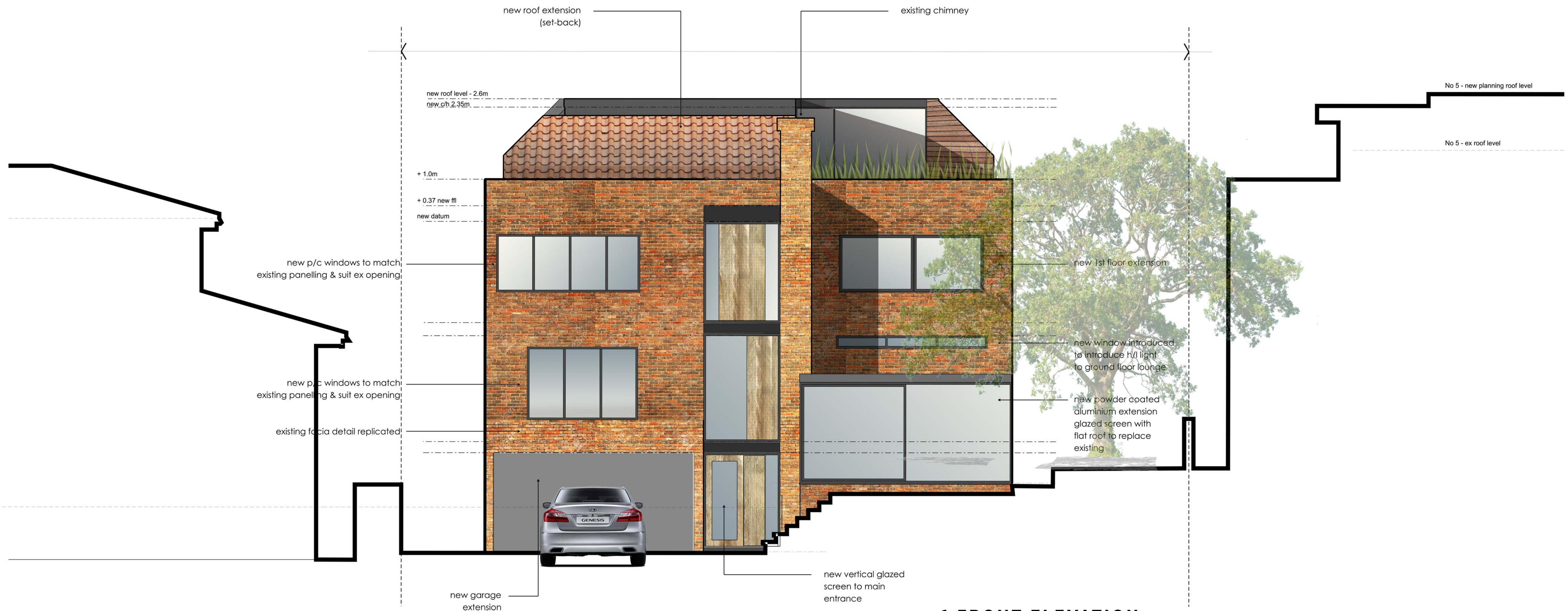
1. FRONT ELEVATION