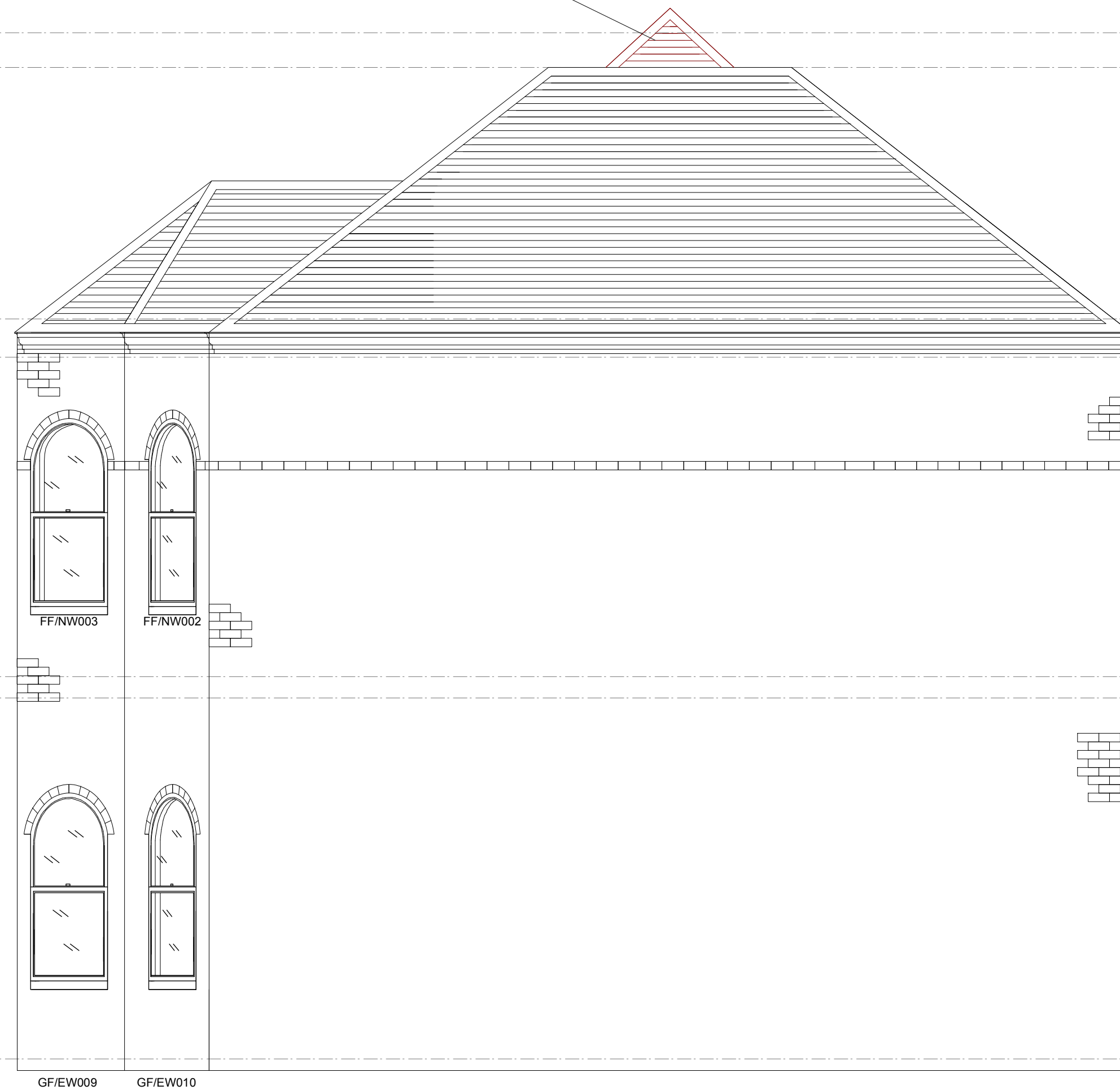
EXISTING ELEVATION SEEN FROM ADJOINING OWNERS showing Approved Alterations

Listed Building Alterations have been Approved under Planning Application - 2017/1426/P Decision Granted 13-06-2017