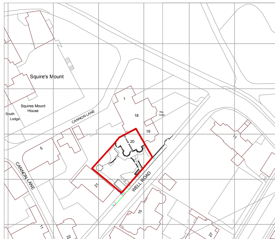
LOCATION PLAN - Scale 1:1250 @ A2