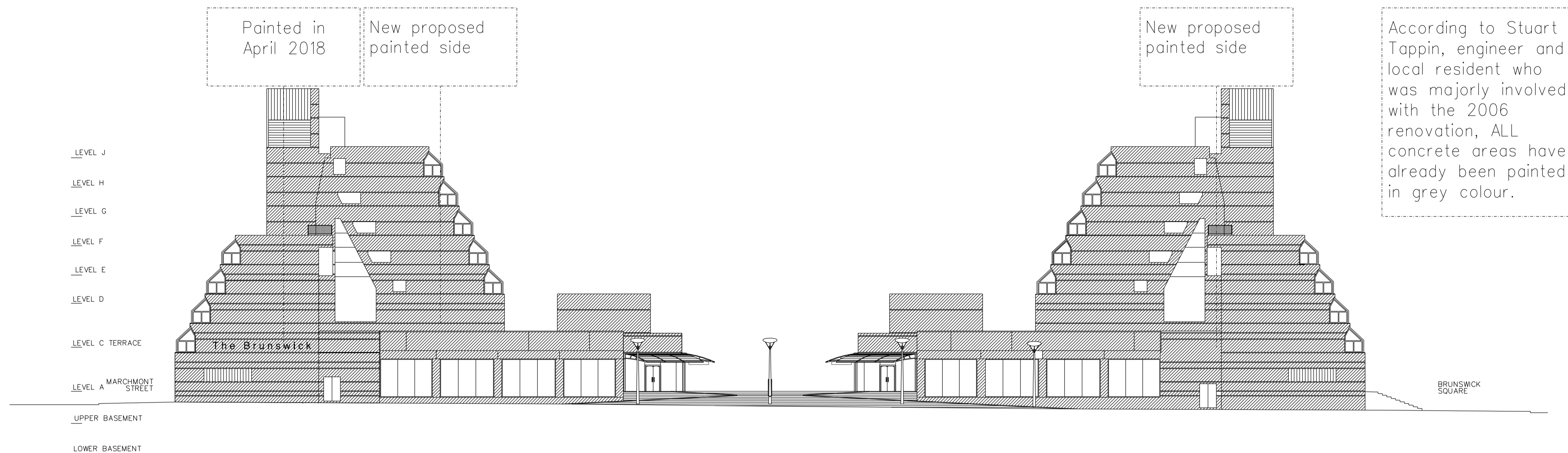
SOUTH ELEVATION (FROM BERNARD STREET)