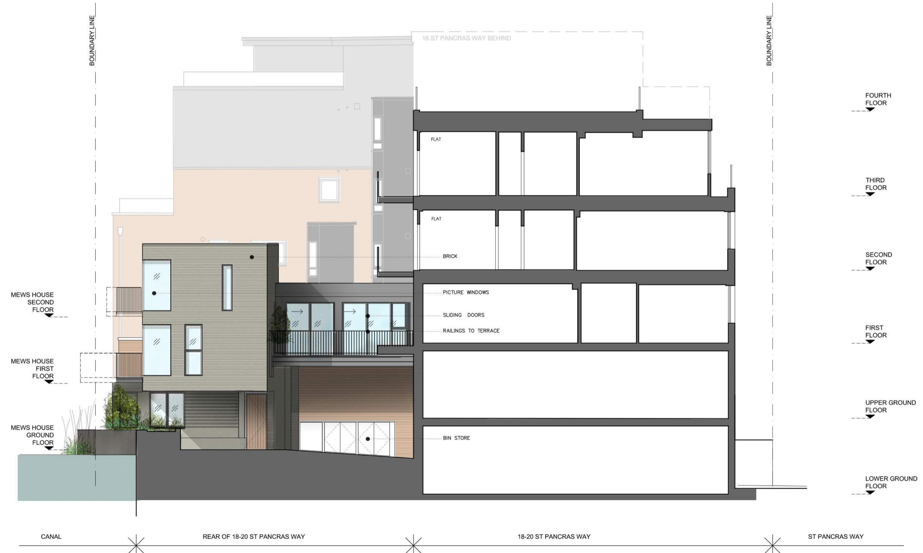
CANAL REAR OF 18-20 ST PANCRAS WAY 18-20 ST PANCRAS WAY ST PANCRAS WAY REAR PARKING ELEVATION