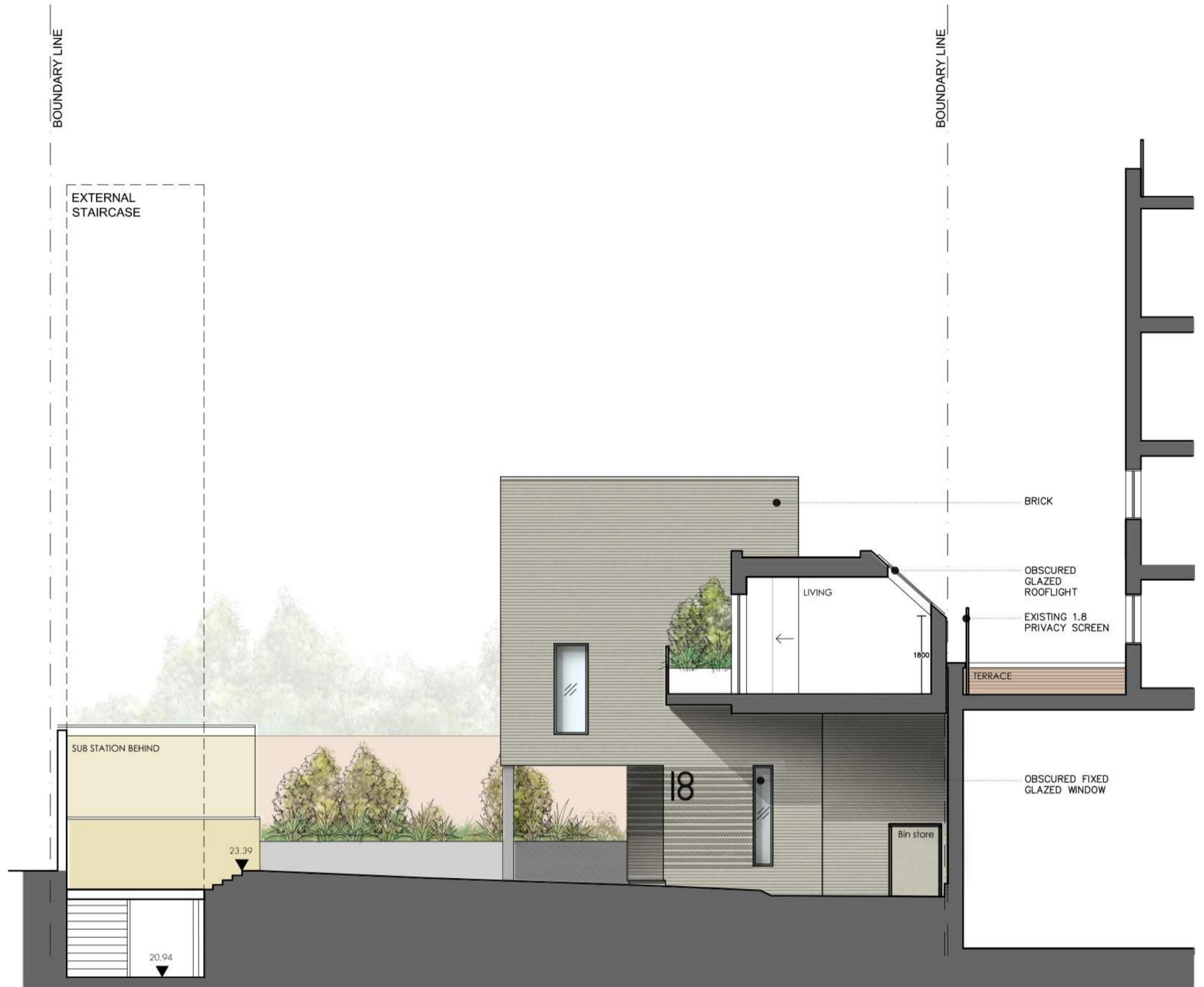
REAR OF 18-20 ST PANCRAS WAY 16 ST PANCRAS WAY REAR PARKING ELEVATION (SECTION DD)