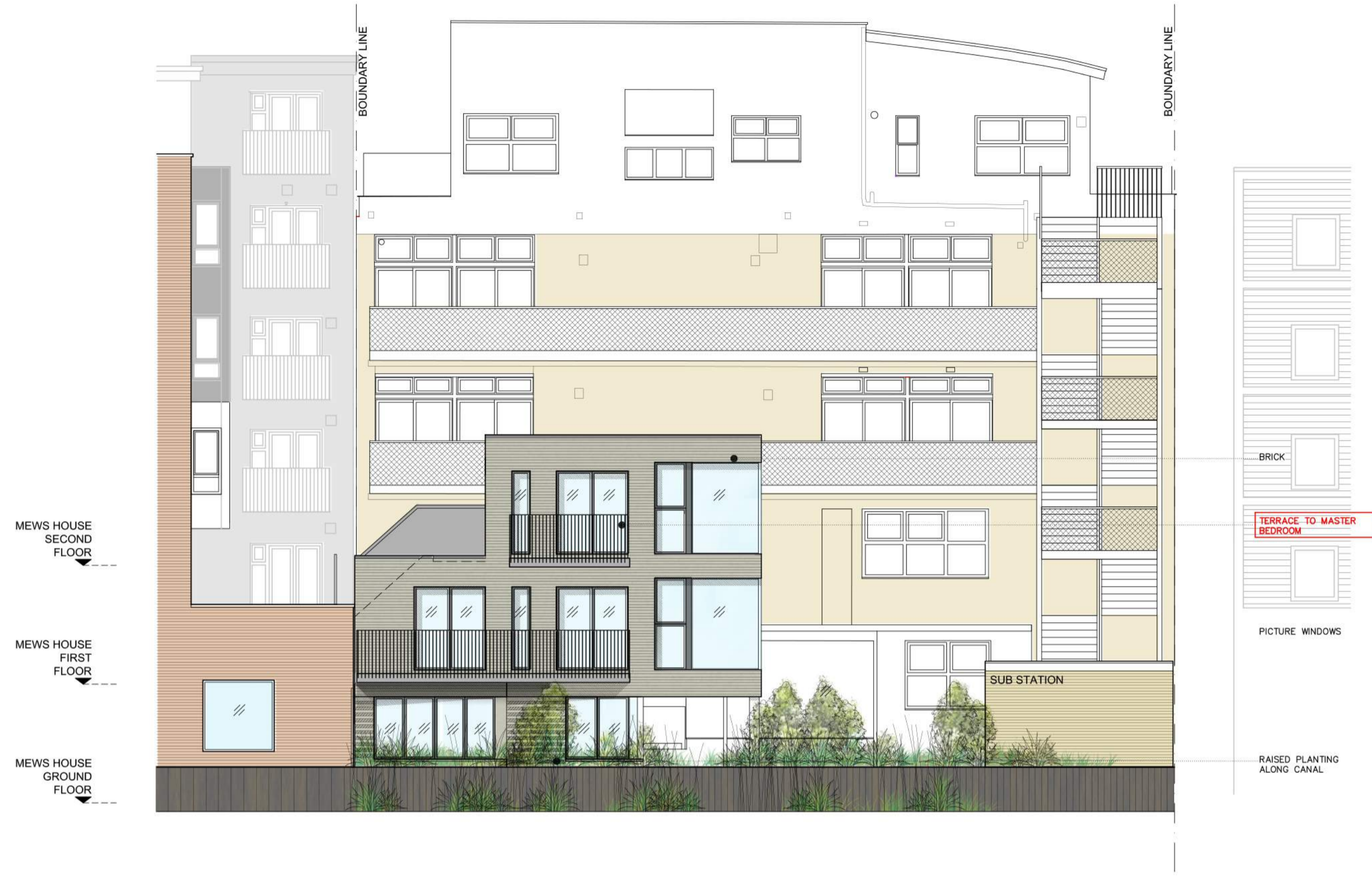
16 ST PANCRAS WAY REAR OF 18-20 ST PANCRAS WAY REAR OF 22 ST PANCRAS WAY CANAL ELEVATION