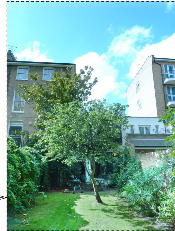
Photo looking towards the rear of 30A Parkhill Rd