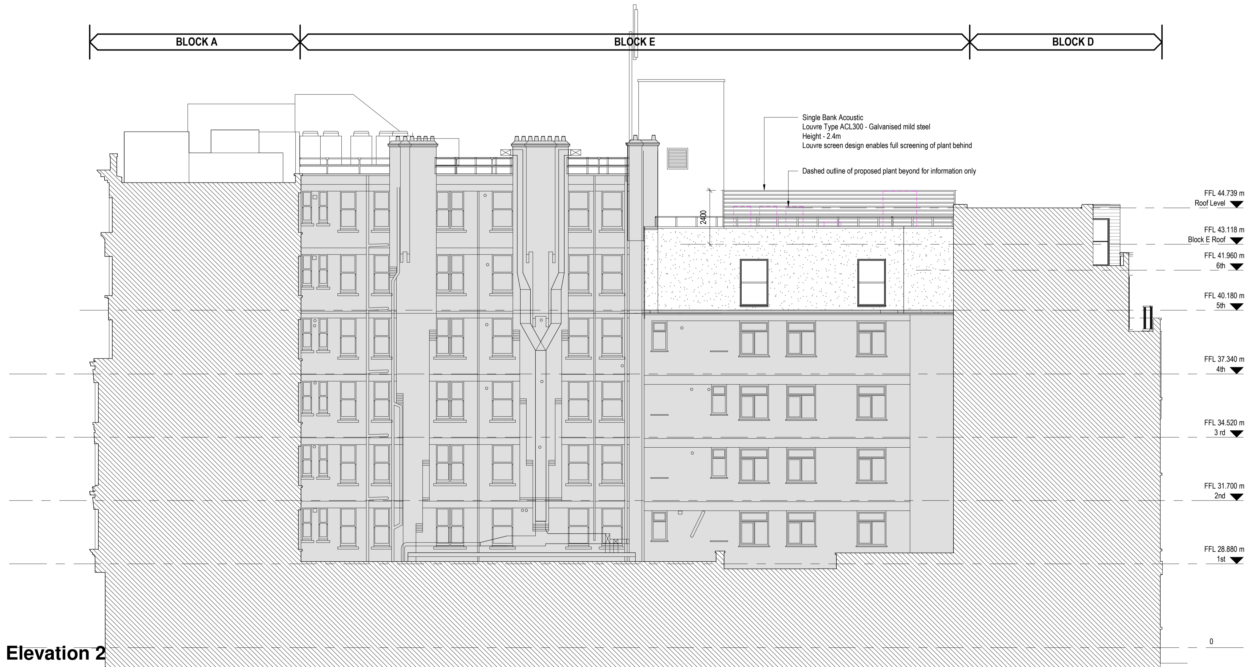
Plant Elevation 2 1 : 100